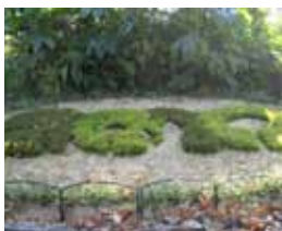
Photo: Catalonia (Spain) awarded a total of € 600,000 to 21 associations and foundations to finance education and awareness-raising activities on climate change. Credit: flickr/ironmanixs

United Kingdom: The IYB-UK, run by the Natural History Museum, and part funded by Defra, admirably adopted the IYB campaign and promoted it among its 450+ participating organisations and entities across