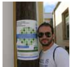
Photo: Biodiversity Action Day: People and organisations in 38 countries took part in this global project, www.biodiversity-day.info.

Greece: The European Centre for Environmental Research and Training collaborated with the Hellenic Network for Biodiversity Research to organise a conference; an Interdisciplinary Postgraduate Summer Training Program and