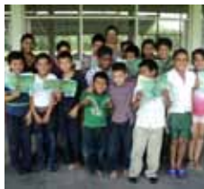
Photo: Biodiversity fair.

Guatemala: Lead by CONAP, many institutions were mobilized to organize activities. Information material was produced and distributed, such as bumper stickers, booklets, technical documents, and the National Strategy for