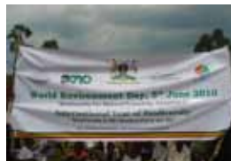
Photo: The Deputy Prime Minister speaking at the World Environment Day Symposium.

Uganda: The NCC celebrated IYB and WED on 5 June 2010. The theme "Biodiversity for National Prosperity. Conserve it". was chosen to enable all levels of society to appreciate the