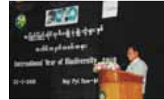
Photo: Minister Douglas Uggah Embas launching the campaign. Credit: Ministry of Natural Resources and Environment Malaysia

Myanmar: The Ministry of Forestry hosted the celebration of IYB. About 200 representatives from ministries and enterprises, international organizations such as