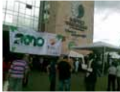
Photo: Workshop on Invasive Alien Species in Protected Areas.

Ecuador: A series of events were organized at the national and the provincial level. More than 45 organisations, as well as the MoE, took part in a large arts and music festival. A TV spot, a widespread