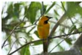
Photo: IYB stamp (set of 4).

Suriname: The Ministry of Labour, Technological Development and Environment communicated the IYB messages through television and media, and also organized