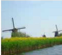
Photo: Latvia’s IYB campaign “Moments of biodiversity”.

Netherlands: The IYB National Committee took the form of a nation-wide Coalition for Biodiversity composed of about 200 local and provincial governments, NGOs, businesses and research institutes that