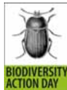
Photo: TF1 featured a Biodiversity Quiz to raise awareness about biodiversity

Germany: BMU established a web-based calendar of events: 1,500 events realised by more than 300 different organisers addressed practitioners, politicians, nature lovers, families and children.