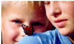
Photo: On 22 May, the International Day for Biological Diversity, young and old hiked on the trails of over 30 nature areas, farmlands and botanical gardens.

Norway released its NBSAP and distributed € 330,130 to various partners and provided training in support of the campaign and to help implement the National