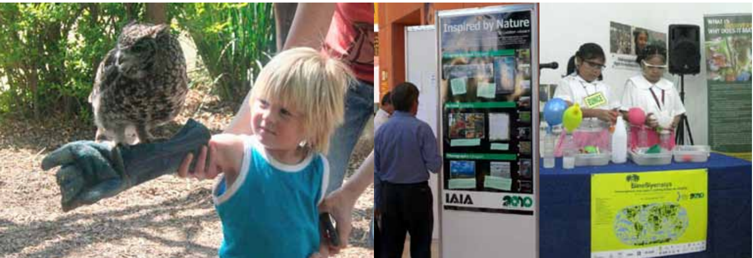
Left: One young patron with a Spotted eagle owl ( Bubo africanus ) perching on his arm. Middle: Featuring winners, runners-up and honorable mentions. Displayed at IAIA conference in Puebla, Mexico. Right: Filipino students perform a science experiment (Science film festival).