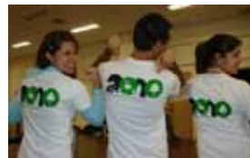
Photo: De Heart uh Barbados 10K run and 5K walk CELEBRATING LIFE ON EARTH 2010.

Brazil commemorated the IYB on the occasion of many international Days (IDB, WED, Health Day, etc.) with events, exhibitions, competitions and activities. One original example