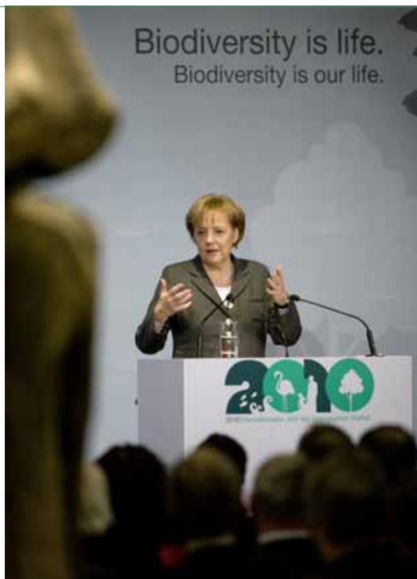
Chancellor Angela Merkel during the official IYB launch in Berlin.

1-5 Feb 2010—Trondheim Conference on Biodiversity (and IYB launch in Norway), with the participation of the Mayor of Trondheim, the Norwegian Minister of the Environment and