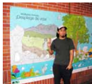
Photo: Short stories and poetry contest.

Colombia: The Humboldt Institute lead the campaign by creating an official website and facebook page (2000 fans). A series of conferences, seminars, competitions were organized and publications and videos were produced for dissemination.