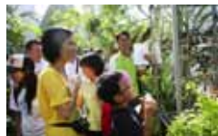
Photo: IYB material distributed to school children.

Singapore: The World Cities Summit 2010 brought together over 230 local and overseas participants among the government, academia, research and landscape