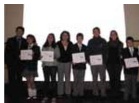
Photo: Biologandos 2010. Universidade Nove de Julho – Uninove.

Chile: The MoE developed a new legal framework for the management of biodiversity. 2010 was also the beginning of the sixth classification process, with more than 400 species classified to date.