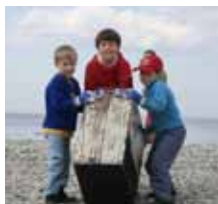
Photo: Locals learning an old fashioned, but very effective method to manage a small, but highly valued nature conservation site near Aalborg, Denmark.

Estonia: May was designated the National Nature Conservation month and many activities took place throughout the year: conferences, competitions, hiking trips, exhibitions.