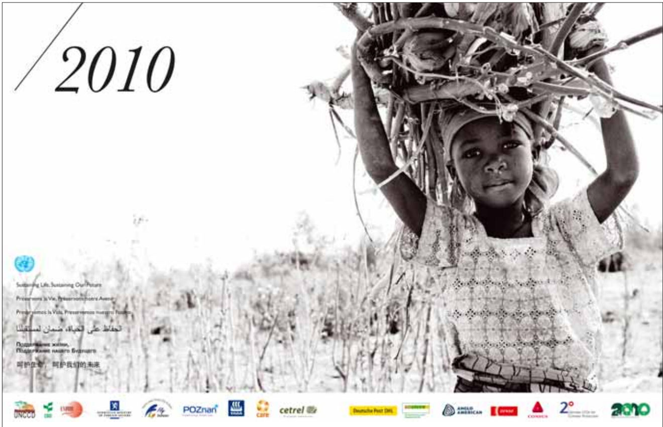
UN Calendar - Sustaining Life, Sustaining Our Future.