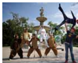
Photo: Conference in Kithira, Greece: "Europe and the Environment: The case of Climate Change and Biodiversity in the 21st century".

Hungary launched the competition for the "European Capitals of Biodiversity" among local authorities in France, Hungary, Germany, Slovakia and Spain. 43 municipalities competed in the national version