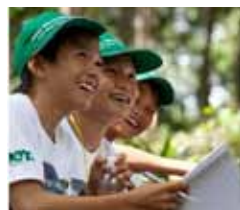
Photo: Guided tour at Hort Park Butterfly Garden.

Vietnam: A talk show and quiz on biodiversity for the celebration of IYB 2010 was held at Giang Vo Secondary School; more than 1,000 pupils took part. At the same time, a tree planting session was organized as part of the Green