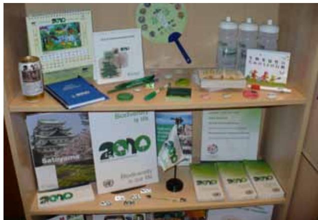
The IYB museum, located at the SCBD, showcases the materials sent by 62 countries and 9 international organisations commemorating the Year

The IYB museum showcases samples of the information materials and promotional items created by governments and organisations. 301 items are currently part of the museum; they have been produced by 62 countries and 9 international organisations. The Secretariat of the CBD has produced and disseminated pins, t-shirts, factsheets, pens, brochures, bookmarks, posters, videos, flags, mugs, and used the logo on letterhead, notepads and all publications.