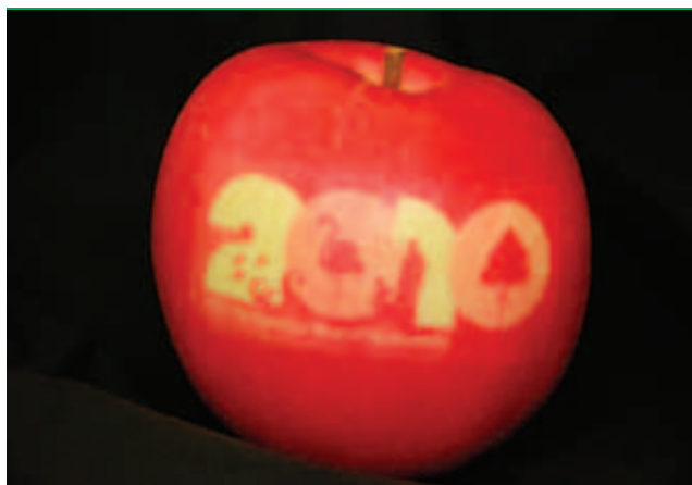
Organic apple marked with the IYB logo.