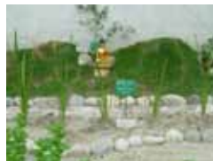
Photo: Myanmar's celebrations for IYB 2010.

Nepal: The International Centre for Integrated Mountain Development (ICIMOD) marked the IYB by organizing various activities including participation in global conferences and meetings, hosting