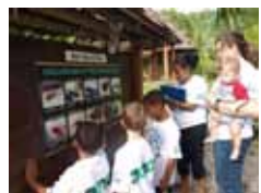
Photo: Auckland schoolchildren.