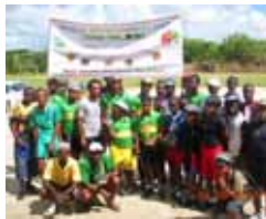
Photo: World Day for Biological Diversity. Instituto de la Costa Sur.

Guyana: Many IYB activities (exhibitions, environmental camps, tours, films, seminars, youth forums, etc.) were organised under the patronage of the EPA. These activities coincided with the preparation and submission of