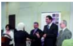
Photo: Featured during COP10, the MERRY PROJECT is an official partner for IYB.

Jordan: A competition was organized among students at schools (including best article and best graphics). There was also a competition for journalists related