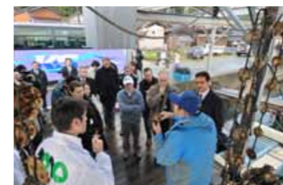
• Visiting an oyster farm in Nanao Bay, part of satoumi

Tazuruhama Wild Bird Park (Nanao City) → oyster farm (Nanao City) → west Nanao Bay → Noto Fisherman's Wharf (Nanao City) → Shirafuji sake brewery (Wajima City) → Inachu lacquerware shop (Wajima City) → Kiriko Center (Wajima City) → senmaida terraced rice paddies (Wajima City)