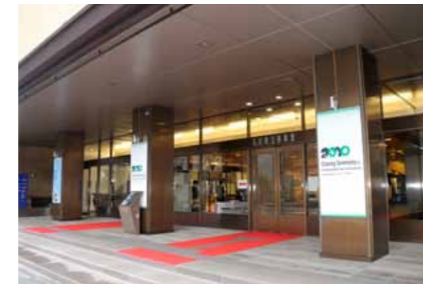
• Ishikawa Ongakudo, Hougaku Hall, the venue of the Closing Ceremony

Date: December 18 (Sat.), 2010, 2:00 p.m. – 6:00 p.m.