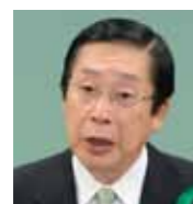
Michihiko Kano Minister of Agriculture, Forestry and Fisheries, Japan