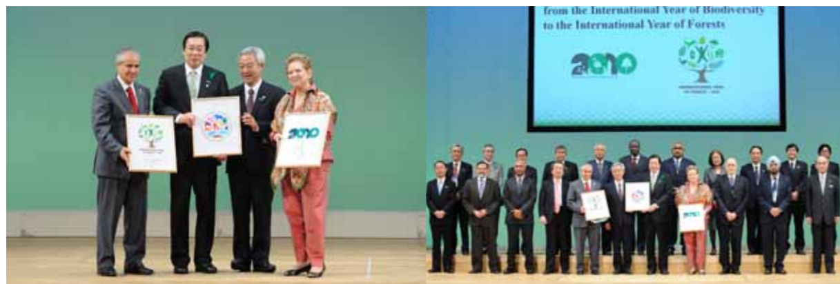
• Ceremony for the transition from the International Year of Biodiversity 2010 to the International Year of Forests 2011