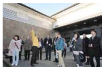
Participants visiting Kanazawa Castle with volunteer guides

Date: December 19 (Sun.), 2010 Participants: 82 people from 20 countries