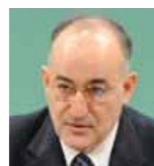
Drago Stambuk Ambassador of the Republic of Croatia to Japan

Forests can contribute to the recharge of water resources, the conservation of land, the conservation of biodiversity and the prevention of global warming. Forestry, the maintenance of forests and trees, can provide employment opportunities and aid in the development of the regional economy. We would like to expand our activities in the restoration of forests and forestry, not only in Japan but also beyond our borders, and we hope that sustainable forest management will be promoted throughout the world.