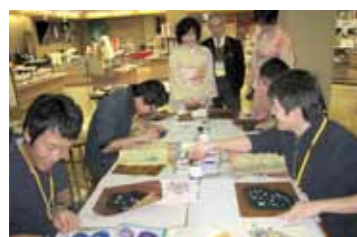
Wearing a kimono and pattern dyeing at the Kaga Yuzen Traditional Industry Center