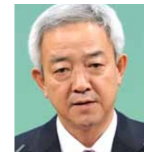
On behalf of the Japanese Government Ryu Matsumoto COP10 President Minister of the Environment, Japan