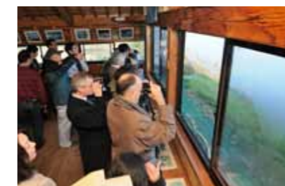
• Observation of migrant birds resting in the western part of Nanao Bay