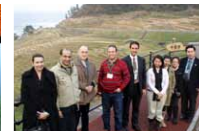
• Visitors cheered at the sight of terraced rice paddies facing the Sea of Japan