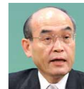
On behalf of the venue Masanori Tanimoto Governor of Ishikawa Prefecture