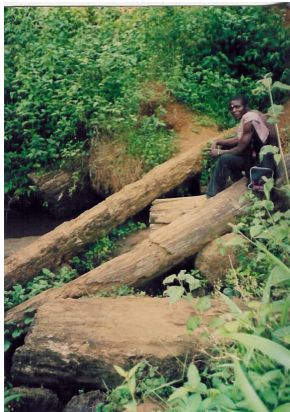
Broken foot bridge