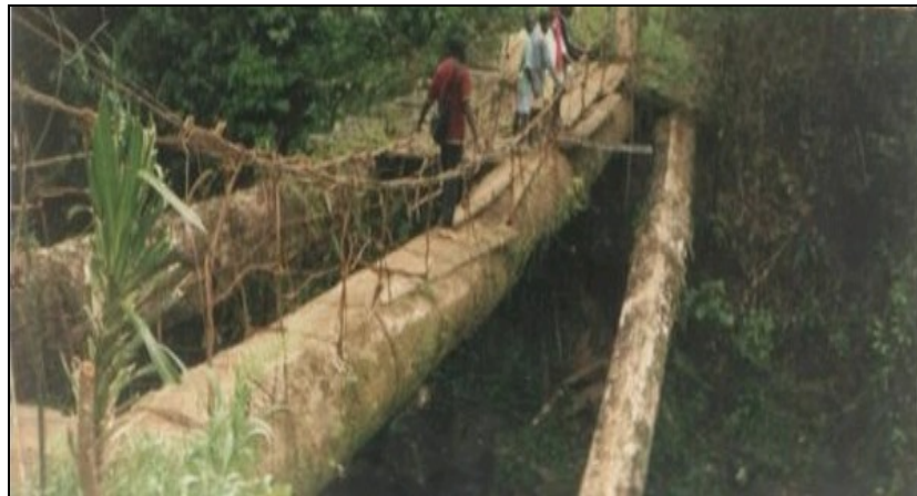
In Meme River Forests Reserve and Meme River Community Forests