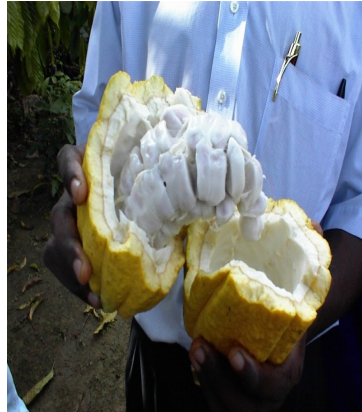
Fresh Cocoa Pod and seeds