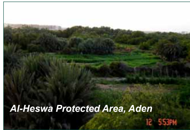
Al-Heswa Protected Area, Aden