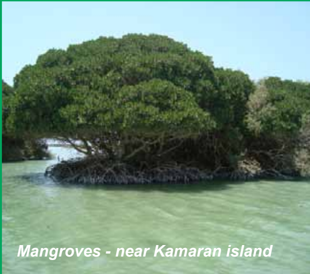
Mangroves - near Kamaran island

its key national stakeholders, both at the policy and community levels, UNDP is currently working on an overall policy framework that integrates environmental management into national development and poverty alleviation policies and programmes. UNDP is also supporting the Government of Yemen to enable national authorities to implement a wide range of international environmental conventions and instruments.