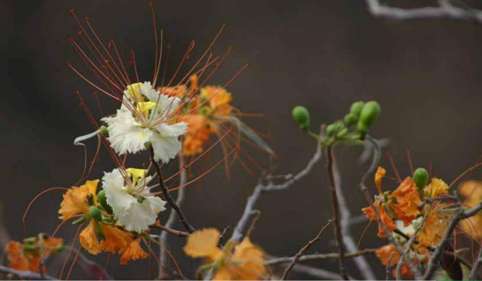
Delonix elata (Um Al-Hejar, Aden)