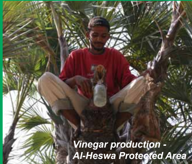
Vinegar production - Al-Heswa Protected Area