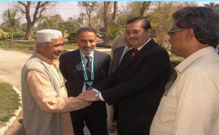
Rotary Club Governor for Pakistan & Afghanistan on 14 th Feb