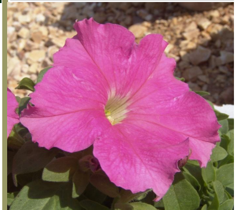
Petunia x hybrida