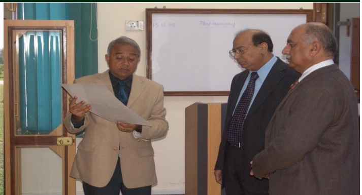
Mehran University Vice Chancellor 9 th Feb