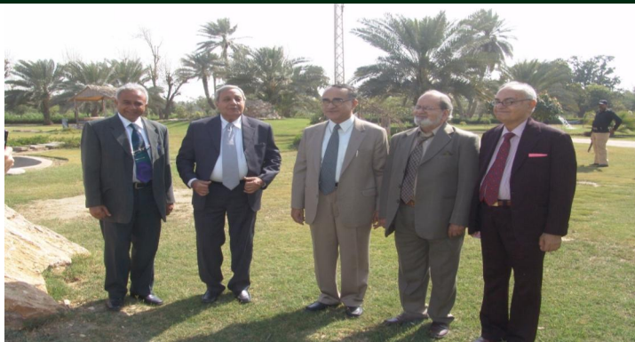
Senate Members of University on 8 th Feb