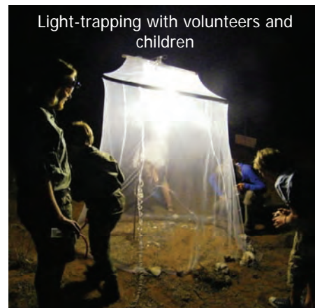
Light-trapping with volunteers and children

Hugo wanted to see a reptile, but unfortunately we hadn't captured any yet during his visit. In the reptile project our first capture was a Cape thick-toed gecko which we dedicate to Hugo as thanks help with the insect study!