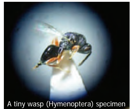
A tiny wasp (Hymenoptera) specimen

When studying insect habitat we found as grass diversity increases so does insect diversity. However, what is interesting is that at a certain point insect diversity drops, even if grass diversity keeps increasing. This seemingly strange result is known as the "paradox of enrichment" and gives us much to consider future studies.