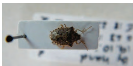
A pinned stink-bug (Pentatomidae) specimen

had. We collected 89 insect families! This included moths, beetles, wasps, ants, flies, praying mantis, dragonflies and bugs (a biological term...Hemiptera=bug). Ants were the dominant type of insect in every habitat we sampled, showing their diversity and adaptability. We displayed the insect specimens on entomological boards to be kept for Kuzikus' museum.