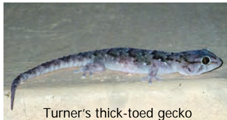
Turner's thick-toed gecko