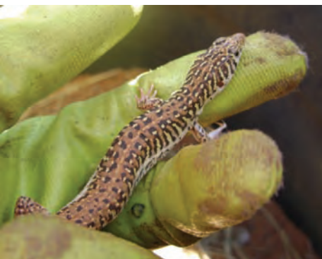
A spotted sandveld lizard captured

For the first time BRinK investigated the reptiles of Kuzikus. This project was hard work, with much preparation to do, digging pitfall traps and setting up a fence. Angola, one of the workers from the village on the reserve, helped. With him work was a lot quicker and he was interested in what we were doing. We used a few reptile tracking methods and day and night surveys.