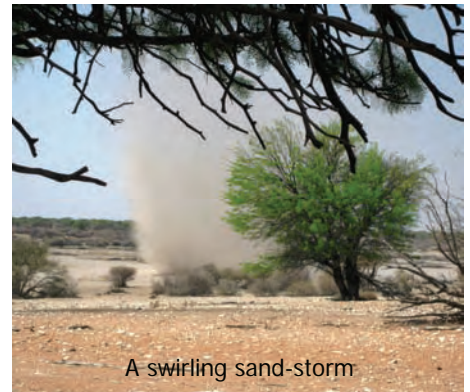
A swirling sand-storm

In September spring had arrived, and much to our relief the cold nights and dust storms were gone. The vegetation flourished and the desert was transformed to waving tall green grasses and flowers.