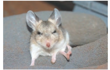
Tiny Gerbil Mouse caught by hand!

Over 90 individuals were trapped, including 5 different species: Bushveld Gerbil, Grass Mouse, Pygmy Mouse, Rock Mouse, and the Hairy-footed Gerbil. 4 more were seen but not trapped including Acacia Rat, Gerbil Mouse, Brush-tailed Hairy-footed Gerbil and a glimpse of one unidentified. 18 species should occur in the Kuzikus biome according to the literature so we