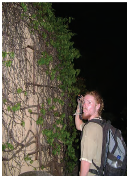
On night survey looking for geckos

At the beginning, it was a joke: "If I fail my exams in September, I will have nothing to do until March and I will return in Kuzikus". So, be careful; jokes can come true! I had already volunteered on the small mammal project and now I took a fancy to the reptiles. Maybe I was too lazy to find another place or I said to myself that now they know me in the reserve, it will be easier to get in, but why spit on those opportunities? I also have to say that although I did not have a lot of time to organise myself the reptile project really motivated me. And anyway: "Why search somewhere else when you find a good place?" In fact, one month of camping in the middle of nowhere and chasing little rodent and reptile animals is just, for me, the perfect experience.