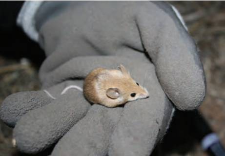
A pygmy mouse, Mus indutus

40% of all mammal species are rodents yet until now they have gone undocumented in Kuzikus. We chose to investigate ground dwelling small mammals with live trapping methods. We baited three types of trap with tasty foods such as rabbit food, apple and peanut butter and left these out day and night.