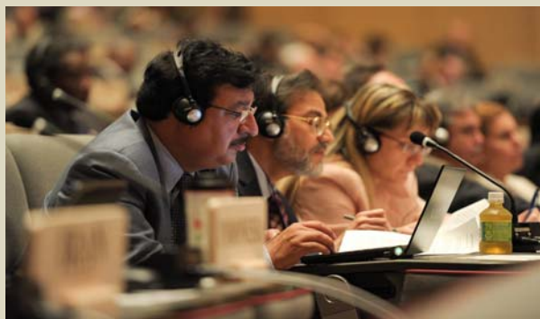
COP-10, Nagoya, Japan