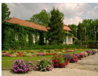
Institute of Ecology and Botany of the Hungarian Academy

The project aims to achieve this goal through expanding the current functions of the world's 13th largest agricultural gene bank, the Research Centre for Agrobiodiversity, having more than fifty-years of experience in the conservation of agricultural genetic resources. The establishment of a joint seed bank for the agricultural and wild flora would be a unique and demonstrative example worldwide in line with the objectives of the Convention on Biological Diversity, as the genetic diversity of the Pannonian biogeographical region's entire flora, including the wild flora as well as crop and vegetable plants serving human nutrition are aimed to be conserved at one place.