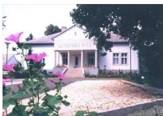
Research Centre for Agrobiodiversity

The main goal of this project is the long-term seed preservation of the wild vascular flora of the Pannonian biogeographical region in order to assist and complement in situ species conservation activities. In addition to the increased safety in case of accidental loss or degradation of endangered populations of rare species in the natural, native habitats, ex situ seed banks may provide additional possibilities for monitoring genetic changes in wild populations, facilitate access to research material without increasing the rate of disturbance of and pressure on the original habitats, and assist multidisciplinary studies on factors involved in the maintenance of diversity and stability in plant associations.