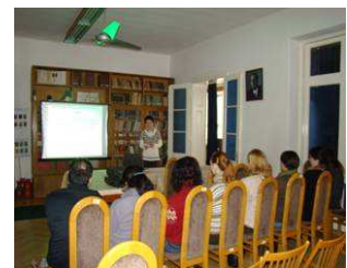
Training for MSc and PhD students

For more information please visit our website: www.pannonseedbank.hu