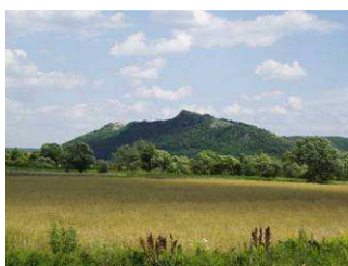
Esztramos mountain, Aggtelek National Park