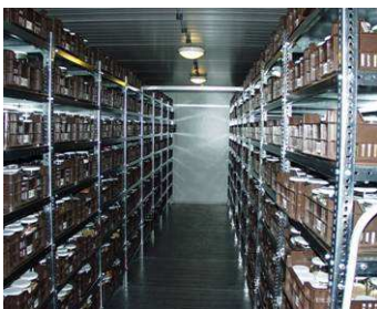
Storing cabinet of active collection