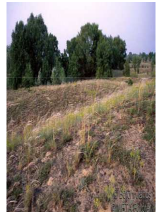
Pannonic sand steppes