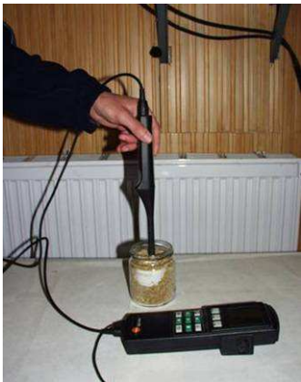
Seed moisture testing