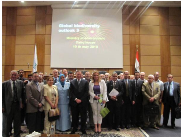
Global Biodiversity Outlook3 event