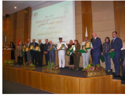
Certificates of Appreciation distributed to Environmental Leaders