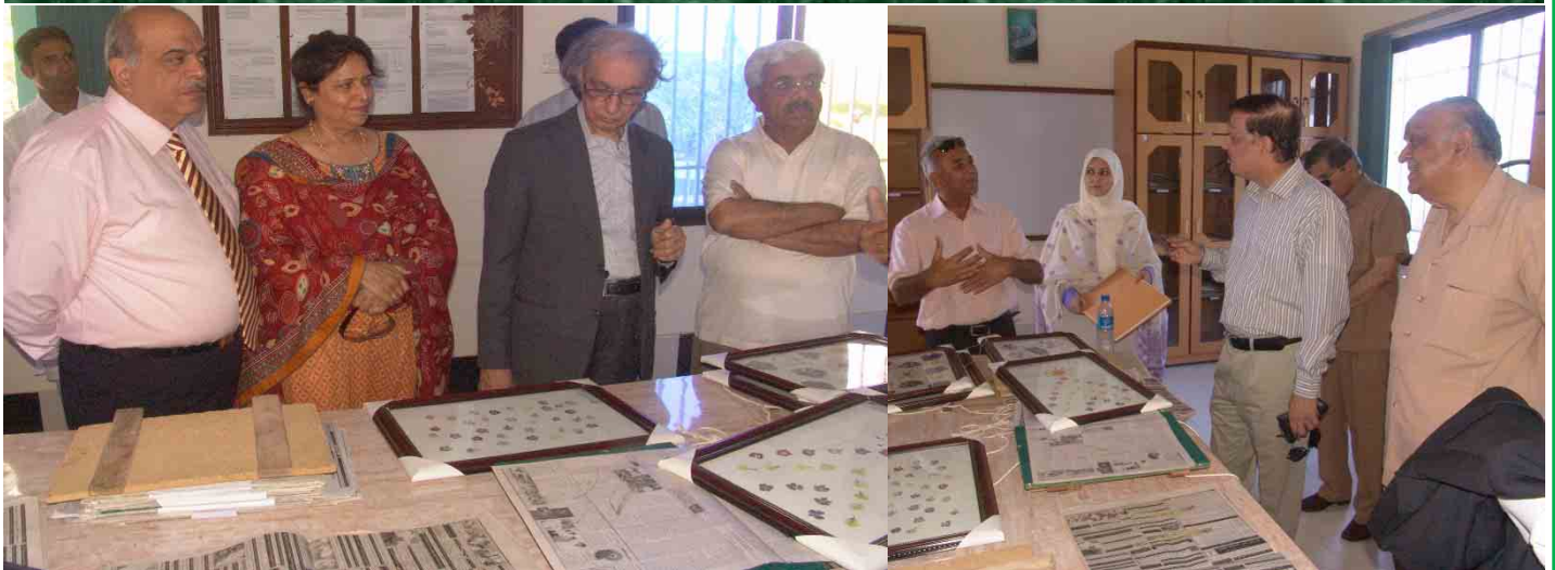
Vice Chancellors of Universities of Sindh Province visited the Shah Latif University Botanical Garden & Herbarium (SLUBGH) on 7th May 2011