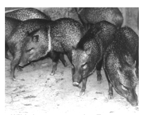
Wild hog or quenk, <u> Tayassu</u></u> <u>tajacu</u> originally roamed in large bands of 40-60 individuals. Such large groups are no longer observed.</u>