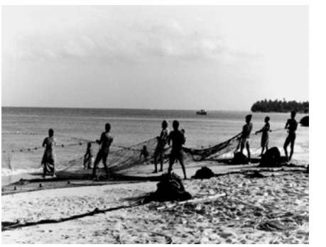
Pulling seine, Castara.

Tobago, a dynamic and well-respected environmental non-governmental group in Tobago.