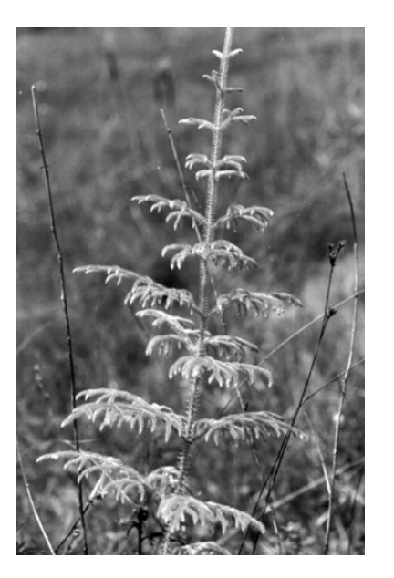
Christmas fern, lycopodium spp commonly used during this season in floral arrangements

In its population policy document, the Population Council of Trinidad and Tobago (1997) agrees that the increasing population of the country can be expected to accelerate the rate of environmental degradation. It suggests that a target stable population for the country should be set at