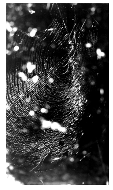
Spider web network.