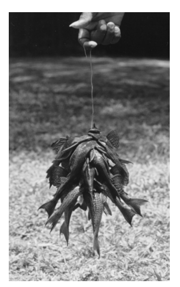
Teta from the Lopinot River. Overexploitation of river fish is a common problem.

"The Government is dumb deaf and blind to the plight of fishermen. They must open their ears to hear them, open their eyes to see what is happening, and open their mouths to speak with them."