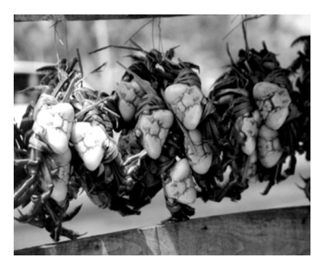
The common sight of blue crabs Cardisoma guanhumi for sale on the highway.

"Crab catching when the crabs are 'running' is a serious problem. This is when they are going to lay their eggs. They get whitish, and only after they lay they get back their bluish colour."