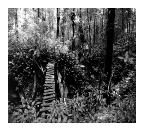
Forested walk at Lizard Springs, a proposed scientific protected area.