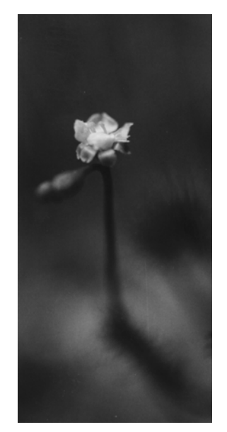
The rarely seen flower of the insect-eating sundew, Drosera capillaris , from the Aripo Savannas. The area is threatened by squatting, fires and quarrying.