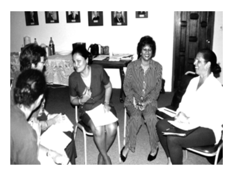
NBSAP stakeholder discussion on the Tourism sector.

The general feeling by the public about the corporate involvement, is that there is much more that can be done by this sector, in terms of supporting existing initiatives with their organizational resources and by financial commitment.