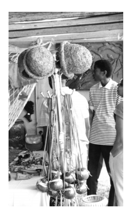
Handicraft using the calabash and hats made from the nests of the yellow-tail or crested oropendula.