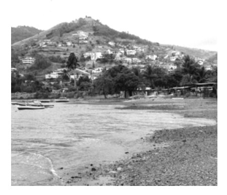
Hillside development in Carenage contributes to the siltation and plumes after each heavy shower of rain.

Some extremely successful collaborations include that between the Wildlife Section and the San Juan Rotary Club for manatee protection in the Nariva Swamp. The Rotary Club has developed a project proposal establishing a Manatee Conservation Trust, with representatives from all stakeholders including Government as well as NGOs. Another example is between the Forestry Department of the THA and Environment