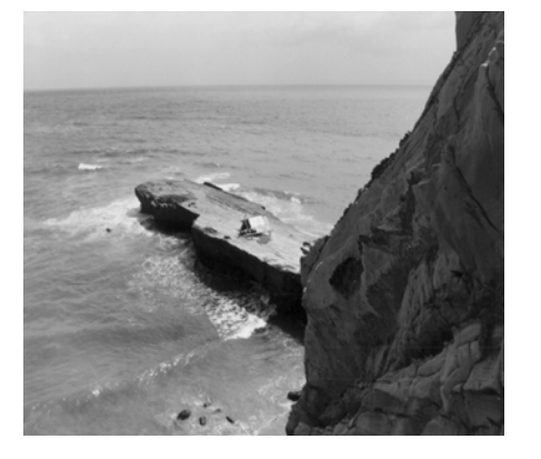
Table rock, Galeota point.

NGOs and CBOs are engaged in biodiversity conservation through initiatives in research, species and ecosystem management and education. The T&T Field Naturalists' Club has a long tradition of scientific research on the biota of T&T, and has contributed significantly to the knowledge base. Several organizations have contributed knowledge regarding their specific interest floral or faunal group, for example orchids, game fish, horticultural species, and birds. The Zoological Society of T&T and the Pointe-a-Pierre Wildfowl Trust conducts ex-situ species management. Species protection within its habitat is conducted by the Fishing Pond Environment and Community Group, GREAT, Nature Seekers Inc. and the Toco Foundation. Ecosystem management is conducted by the Asa Wright Nature Centre on their forested lands in the Arima and Aripo Valleys.