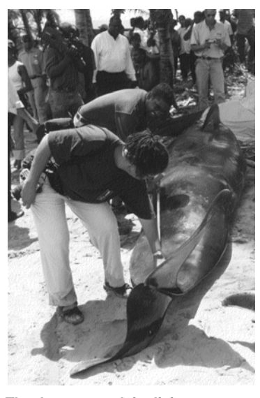
The largest pod in living memory of beached Pilot Whales occurred on Manzanilla Beach 1999. Numbering 25 whales, the occasion created the largest outpouring of interest and concern from the public, private sector and government agencies, all coordinating in an attempt to save the whales.