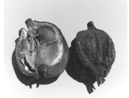
Seedpod of crappo. Carrapa guianensis. Oil is extracted from the seeds and used medicinally for massaging the body and joints.

The total value of wildlife harvested from 1990 to 1995 was over TT$25 million. Revenues collected for the exploitation of this resource being barely $750,000. or less than 0.5% of the value of the take.