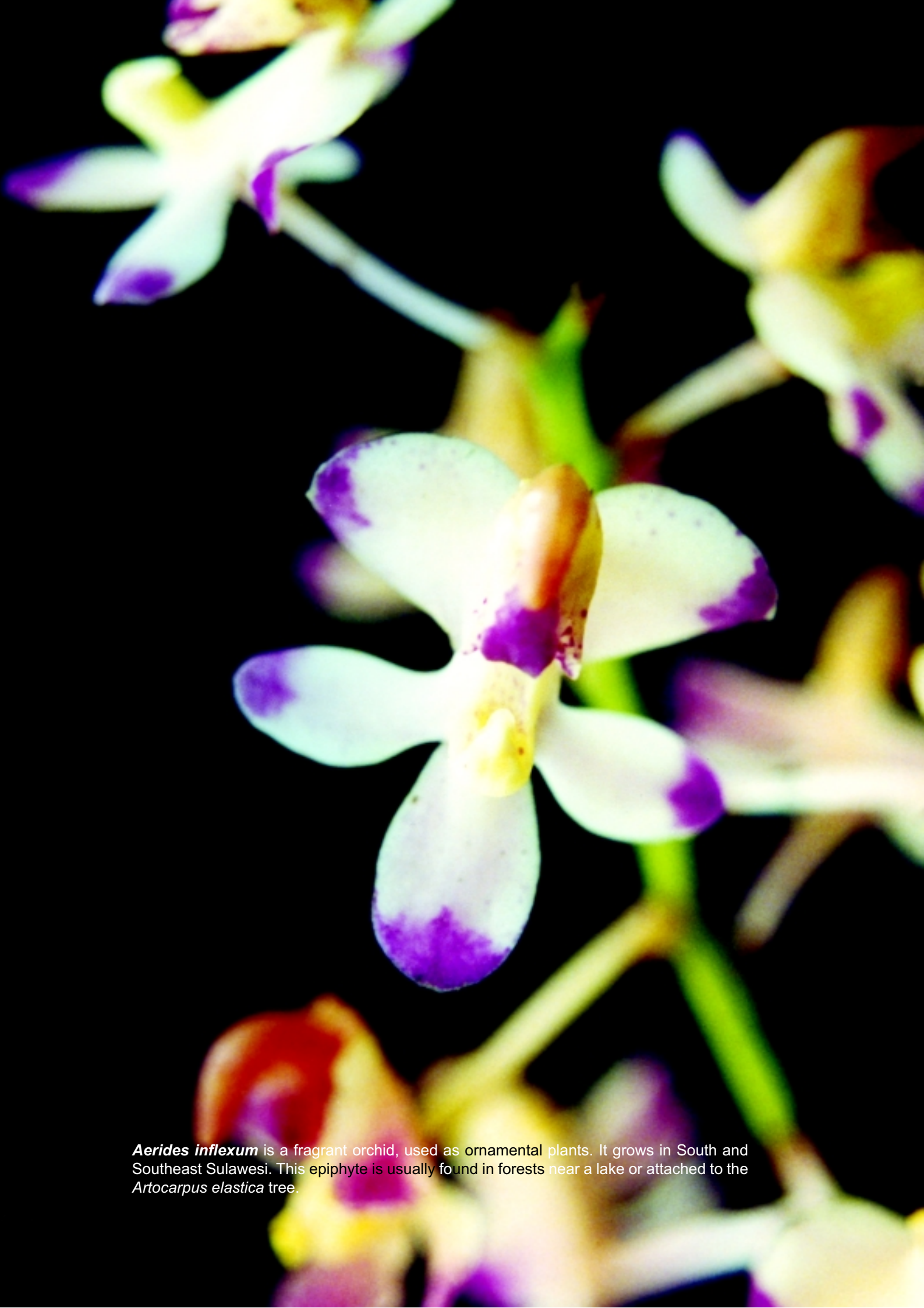
Aerides inflexum is a fragrant orchid, used as ornamental plants. It grows in South and Southeast Sulawesi. This epiphyte is usually found in forests near a lake or attached to the Artocarpus elastica tree.