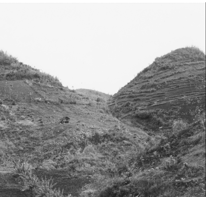
Figure 2.6. Land degradation resulting from economic activities that put strong emphasis on short-term growth.