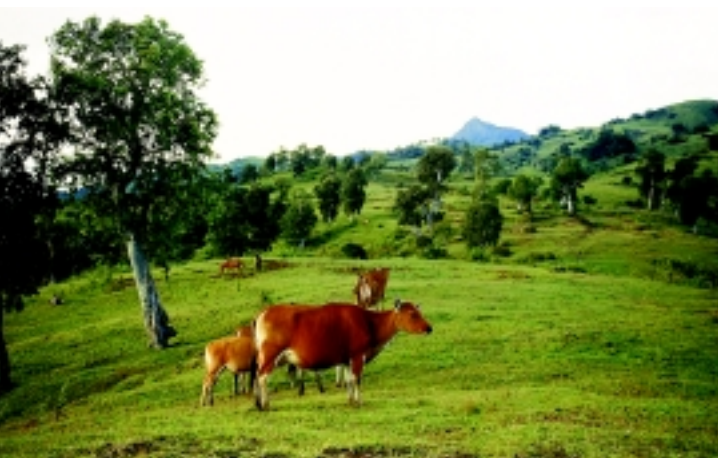
Figure 2.2. Savannah grassland as a dominant landscape in Nusa Tenggara.