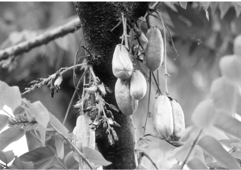
Figure 2.8. Medicinal plants cultivation is one of the potentials for sustainable development that need further exploration and development.