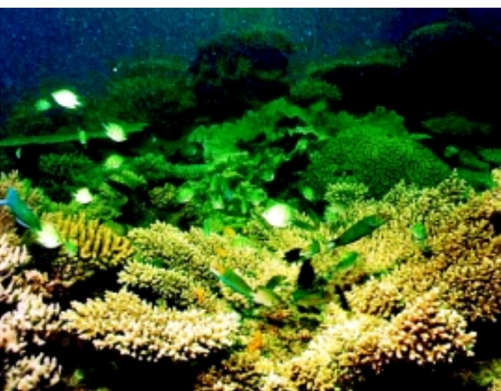
Figure 2.3. Coral reefs is one of the marine and coastal ecosystems that are vulnerable to human disturbance.