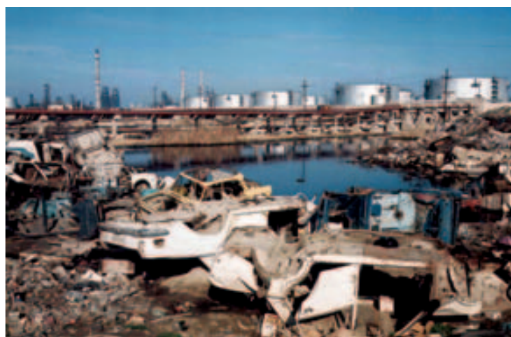
Picture 2.3. Pollution and dumped rubbish on the Absheron Peninsula near Baku

The Republic of Azerbaijan has a great wealth of natural resources, however in recent decades, human activities have caused several ecological problems in the environment, such as the loss of biodiversity.