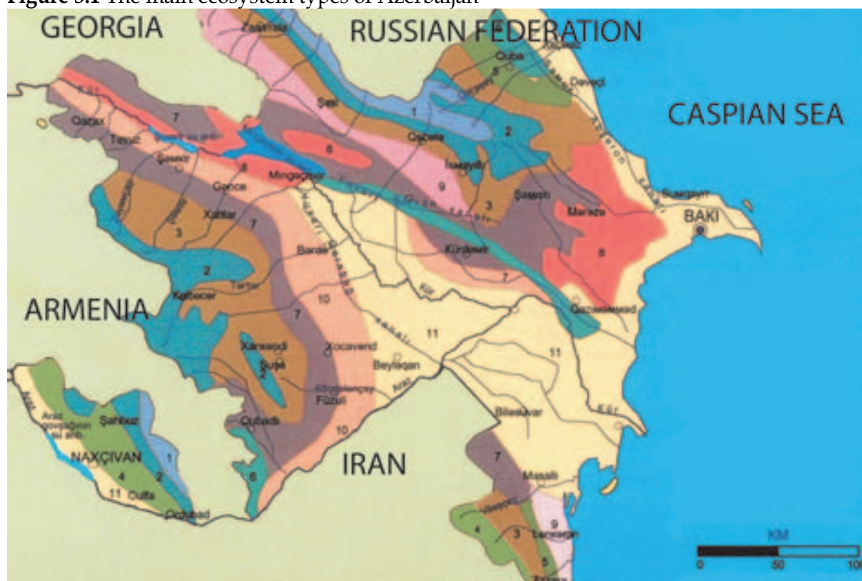
Figure 3.1 The main ecosystem types of Azerbaijan