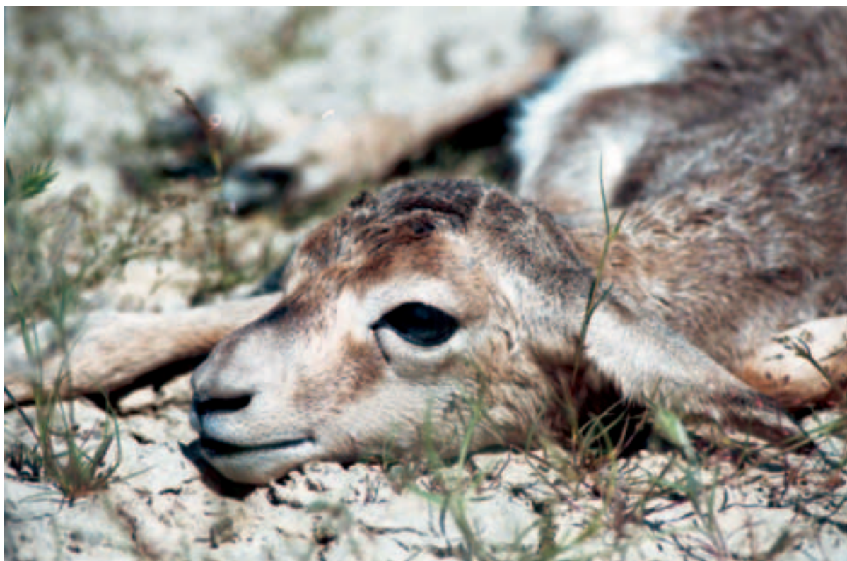
Picture 3.9. Goitred gazelle Gazella subgutturosa fawn in Shirvan National Park

and hares; 2 species), Rodentia (rodents; 36 species), Carnivora (carnivores; 19 species, including one species from the suborder Pinnipeda ). The most widespread species of mammal in Azerbaijan include the water rat ( Arvicola terrestris ), gray rat ( Rattus norvegicus ), wolf ( Canis lupus ), jackal ( C. aureus ), fox ( Vulpes vulpes ), stone martin ( Martes foina ), badger ( Meles meles ) and wild boar ( Sus scrofa ).