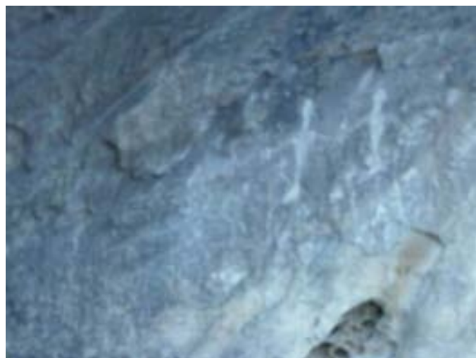
Picture 2.1. Neolithic (Stone-age) rock engravings of human figures and animals at Gobustan

Azerbaijan has a proud and long history. As an ancient centre of civilization, it has a great cultural heritage created over thousands of years. Prehistoric people inhabited the region,