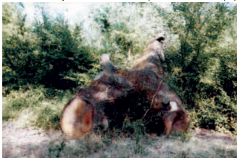
Picture 3.11. Felled oak tree Quercus longipes in Nabran forest

There are many areas in the country where the local populations do not have access to