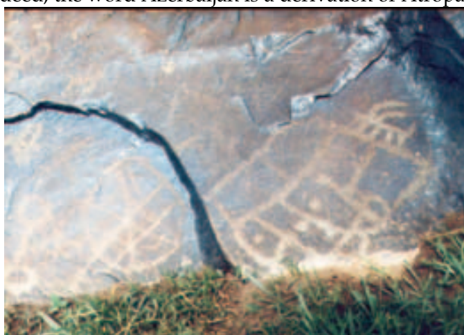
Picture 2.2. Stone-age rock engravings at Gamigaya, Nakhichevan

Tribes in the region formed in the third millennium BC, and political organisations were created in the first millennium BC. The state of Manna was established during the ninth century BC with a well-developed cultural and economic basis. At this time the people believed in natural phenomena, the sun and the moon. In the first part of the sixth century BC, Manna was conquered by the Midiya state. During this period, the main religion was Zoroastrianism, based around the natural gas and oil sources that ignited as they escaped from the ground. The states of Albania and Atropeana played important roles in restoring the territory as an independent state. Indeed, the word Azerbaijan is a derivation of Atropat, an Atropeanan ruler from this period. From the third to the fifth centuries, the state of Azerbaijan strengthened, and Christianity began to spread widely among Azeris. Islam became the main religion in the country when Arabs conquered Azerbaijan in the eighth century.