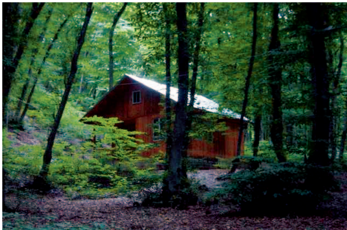
Picture 4.6. Guest house in hornbeam Caprinus spp. woodland Gachresh, Guba region

The main areas used for tourism and spa use are within the Absheron, Nabran, Kura, and Lenkoran coastal resorts, and tourists visit such resorts over five months of the year. Changes in the level of the Caspian Sea have caused a great number of recreational centres on the coast to be flooded. Other areas in the forested mountain regions of Guba, Shemakha-Ismaili, Belokan-Gabala, Kelbajar, Karabakj, Kedabek, Nakhichevan and Ganja-Naftalan are visited because of the presence of thermal springs and medicinal mud volcanoes. Over 250