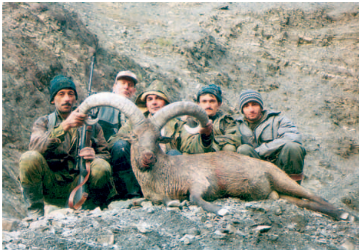
Picture 4.3. Trophy hunting for Dagestan tur Capra cylindricornis in Sheki region

In addition, other species that are fished commercially include a number of Clupeiformes