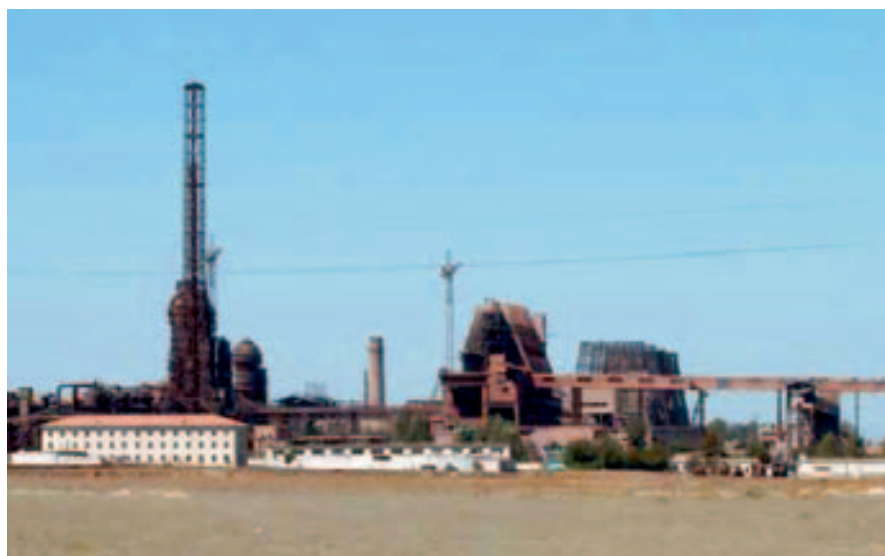
Picture 5.3. Aluminium factory in Ganja

The climate of economic reform has seen a steady development of industry in Azerbaijan over recent years. By 2002, over 5,000 companies were registered, with annual industrial growth equivalent to around 5%. The privatisation of state enterprises has resulted in an increase in market share by private enterprises (up to 47% in 2001, compared to only 5% in 1995). Industry has grown in a number of sectors 50 , but is dominated by crude oil production. In 2001, Azerbaijan produced 14.9 million tonnes of crude oil.