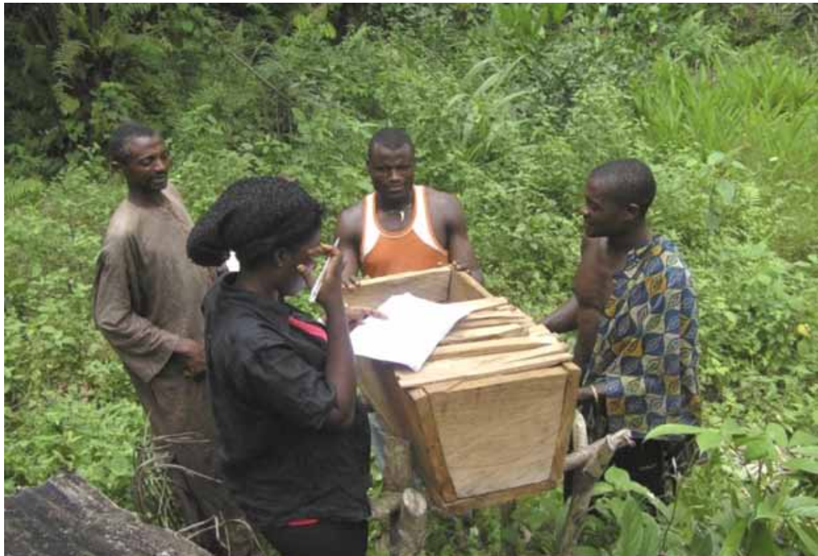
Hive construction during a training workshop in Lebialem, Cameroon