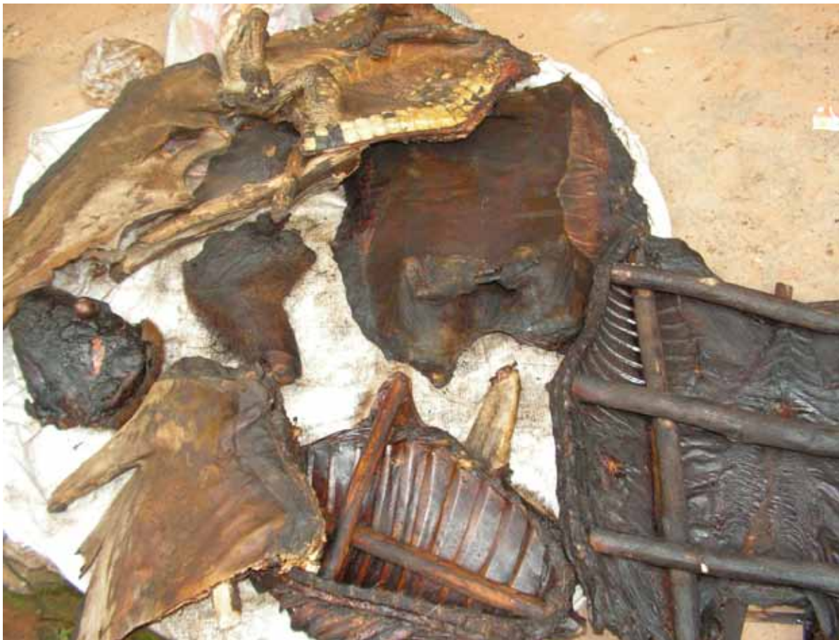
Smoked bushmeat sold in Mamfe, South West Cameroon

Hunting households are not the only beneficiaries of the bushmeat trade. Throughout tropical forest countries, bushmeat generates income for a variety of stakeholders including those who transport it at all points along different supply chains and those who trade it in roadside locations, in established markets, door to door, or in restaurants and shop halls. From first harvest to final sale, the trade in bushmeat for local, national or regional trade now forms an important part of the informal sector’s “hidden economy”. Access to markets is a key factor in realizing economic values of wild products, including bushmeat. If prices and profits are high enough, local traders will make use of any transport networks, over considerable distances to get perishable goods to market. As a result hunting and the bushmeat trade, although largely ignored in official trade and national statistics, play a crucial role in the economies of numerous countries, but being part of the hidden economy, are not tapped as a source of government revenues (Fargeot, 2009).