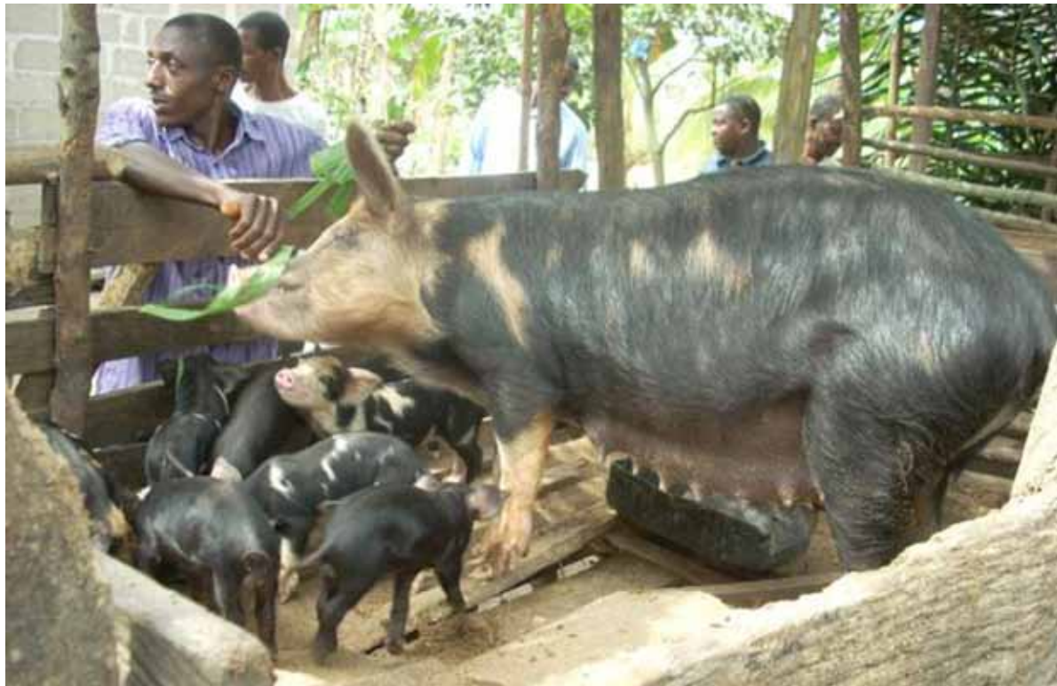
Pig farms developed by Community Action for Development in the Southern Bakundu Reserve area