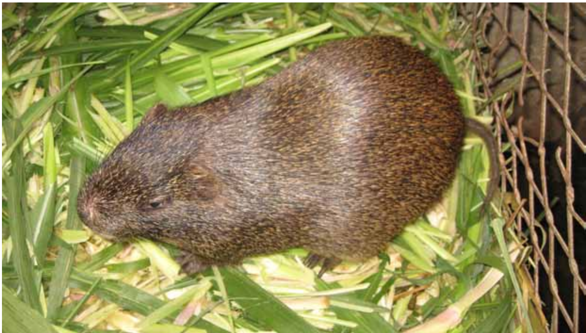
Grasscutter farm at the Faculty of Agronomy, University of Kisangani (Democratic Republic of Congo)