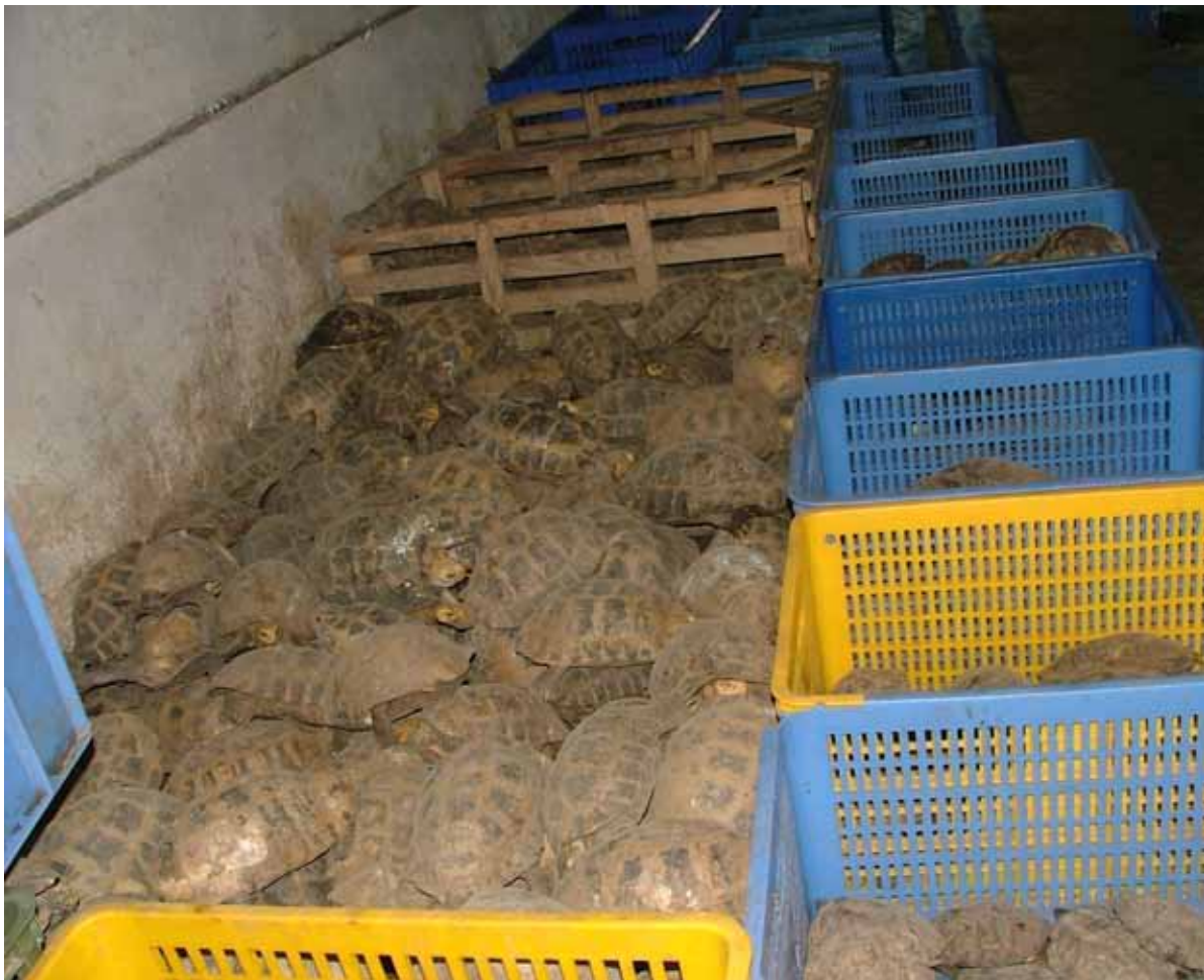
Tortoises sold in a Chinese market

Article 2 of the Convention on Biological Diversity defines sustainable use as: The use of components of biological diversity in a way and at a rate that does not lead to the long-term decline of biological diversity, thereby maintaining its potential to meet the needs and aspirations of present and future generations. In practical terms, a sustainable use is one which is perpetuated over the long term. Often local interest in the resource is an important factor in maintaining its quality. Obviously as one cannot sustainably use a resource that has vanished, the statement that sustainable use is a form of conservation has some merit. It should be clear that all uses, consumptive or non-consumptive, will impact ecosystems in some way. These impacts will translate into more or less dramatic effects on the local environment depending on what is harvested and how. Ultimately, for bushmeat use and alternatives to be sustainable, they must be so from social, ecological and economic viewpoints.