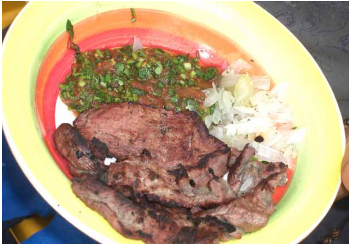
Meat of red brocket deer in a community neighbouring the Calakmul Reserve (Mexico)

The preference for bushmeat is also dictated by cultural reasons, particularly for indigenous peoples. Many cultures still employ traditional medicine that includes animal-derived remedies (Alves and Alves, 2011) and animals often fulfil both a nutritional and a medicinal role. Probably the most famous of these are the Chinese, who use animals for a variety of ailments. Many vertebrates, including tigers, bears, rhinos, turtles, snakes, tokay geckos, pangolins, monkeys and swiftlets are traded as raw materials of traditional Chinese medicine. Lesser known and studied, though just as varied and rich is Latin America's long tradition of animal-remedies for all kinds of ailments. In Africa, bushmeat consumption is also associated with tradition. In some rituals and ceremonies, such as men's circumcision ceremonies in Gabon or burials in South East Cameroon, large quantities of bushmeat must be served to the participants (Angoué et al. , 2000; van Vliet & Nasi, 2008). The traditional role of bushmeat has also been shown in Equatorial Guinea, where some species are considered to have magical or medicinal properties that increase their value (Kümpel, 2006).