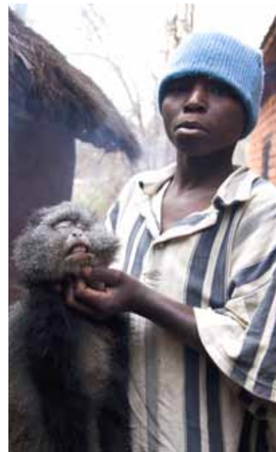
Young man showing a Sykes monkey in Tanzania

For many, the costs of certification itself may be prohibitive. Examples from the field highlight the need for significant donor investment at least in the initial stages. Unless subsidised by donor funding, the initial costs of certification to the communities will be high. Direct costs will vary depending on the number of communities applying for certification and the distance that certifiers have to travel. In the case of wildlife certified products, indirect costs will include the investment needed to ensure that local communities set up sustainable wildlife management schemes that meet certification standards (training in sustainable hunting practices, development of community-based management plans and no-hunting zones, establishment of hunting registers) and the transport of certified products. What is not always clear from existing certification initiatives is whether certification does indeed generate higher prices than non-certified products, which is indeed the only guarantee that beneficiaries will comply with conservation goals. In order to ensure conservation benefits, certified products should guarantee higher benefits than non-certified products, not only on the short term but also over the long term. For wildlife certified products, any drop in prices of certified products would indeed lead to a shift towards unsustainable hunting practices with dramatic effects on wildlife, in order to respond to the existing demand for wildlife products.