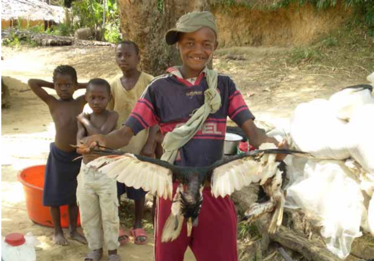
Young kid showing a hunted hornbill near Kisangani, DRC