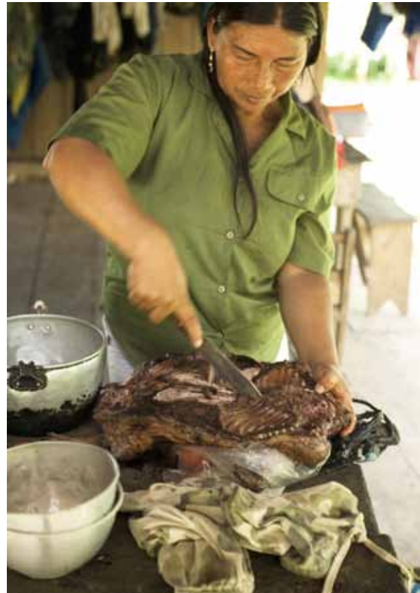
Huaorani women preparing bushmeat in Ecuador

The project also supports the Association of Huaorani Women of the Ecuadorian Amazon (AMWAE). AMWAE, has undertaken dialogues and ongoing community training on governance and land management, which are necessary groundwork to establish hunting rules, regulations, and ecosystem management. An agreement was also signed between AMWAE and Fundación Natura where communities agreed not to trade wildlife and not to hunt tapirs (even for subsistence purposes).