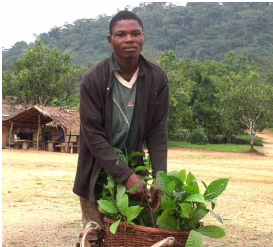
Young man heading to his new cocoa farm: an emerging income generating opportunity around Takamanda National Park

Wildlife trade interventions focusing on poverty alleviation and/or livelihood diversification need to be designed according to the nature and motivation for people's engagement in wildlife trade, and according to the particular species or product being targeted. At similar levels of profitability, hunting might still be preferred as it may offer a wider range of characteristics that make it attractive for forest dwellers (Brown, 2003). These include: 1. High returns to discontinuous labour inputs, with low risk and minimal capital outlay; 2. Excellent storage properties and a high value/weight ratio; it is easily transported and is thus an attractive commodity for producers in isolated areas who have few alternatives; 3. A commodity chain characterised by high social inclusivity, in both wealth and gender terms; 4. Labour inputs that are easily reconciled with the agricultural cycle, and with diversified income-earning strategies; 5. Unlike many high-value marketed commodities, usage can readily be switched between consumption and trade. This range of socio-economic characteristics should be considered when developing alternative sources of income. Furthermore, livelihood interventions targeted solely at subsistence activities, or on poorer households who harvest wild products primarily for their own consumption, seem likely to have little impact on the harvesting of wildlife for trade in order to generate cash income.