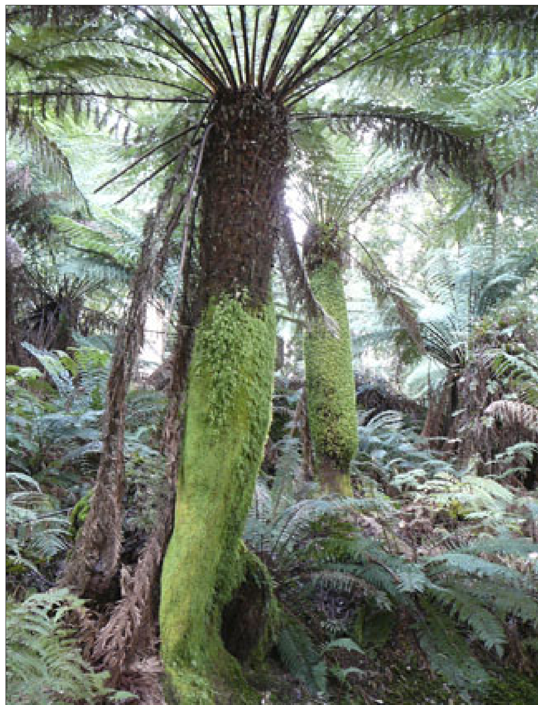
Our home is girt by sea