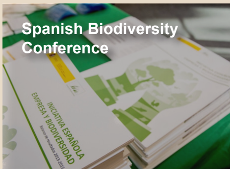
Spanish Biodiversity Conference