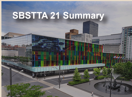
SBSTTA 21 Summary