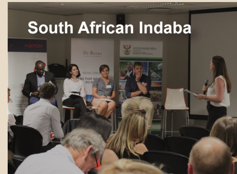
South African Indaba