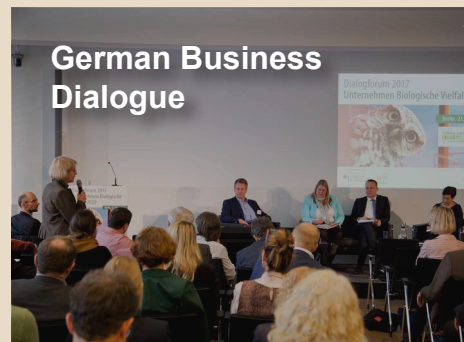
German Business Dialogue