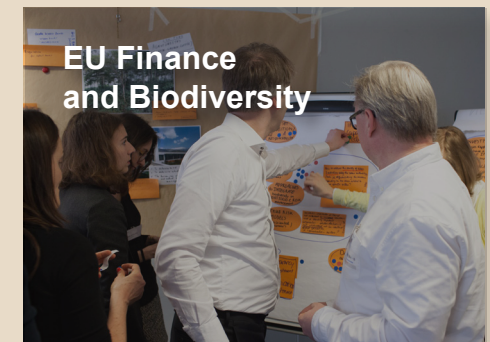
EU Finance and Biodiversity