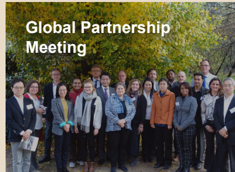
Global Partnership Meeting