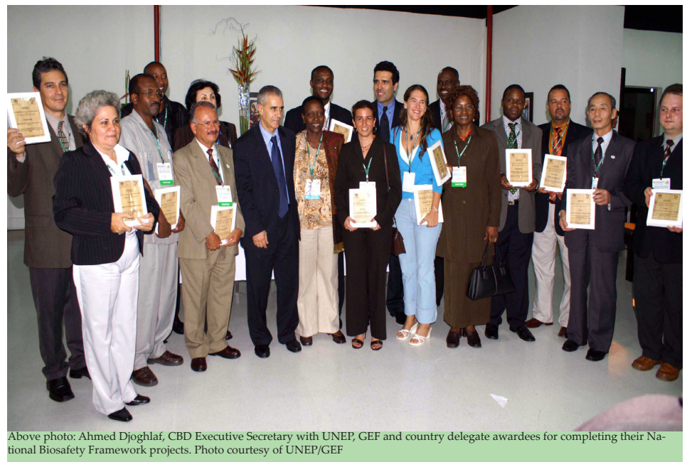
Above photo: Ahmed Djoghlaif, CBD Executive Secretary with UNEP, GEF and country delegate awardees for completing their National Biosafety Framework projects.

on biosafety. It is expected that all countries will have completed their draft NBFs by the end of December 2007. UNEP Biosafety has begun to compile some of its experience with NBF development with a preliminary case study "Building Biosafety Capacity in Developing Countries: Experiences of the UNEP-GEF Project on Development of National Biosafety Frameworks".