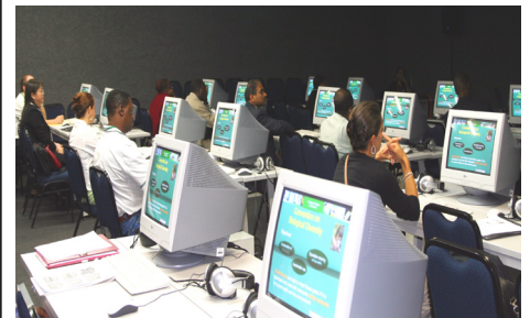
Above photo: Delegates during a BCH training session in Curitiba, Brazil.