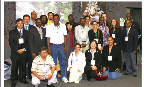
Above photos: Group photos of delegates who participated in the BCH training workshop.