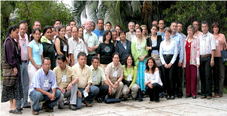
Above photo: Participants to the Environmental Biosafety Course held in CIAT, Palmira, Cali, Colombia in April 2006 as part of the capacity building activities of the Colombia biosafety project.

The World Bank first became involved in GEF biosafety work when two countries sought its assistance in implementing national biosafety frameworks (NBFs). The Bank-GEF projects in Colombia and India to build capacity for implementing the Cartagena Protocol on Biosafety (CPB) became effective in 2003 and are now nearly completed. India and Colombia each received US$1 million in GEF funds (in addition to US$3.5 and US$2 million in co-financing respectively) out of a total of US$9.2 million provided for an initial twelve demonstration projects focused on NBF implementation under UNEP, UNDP and the Bank.