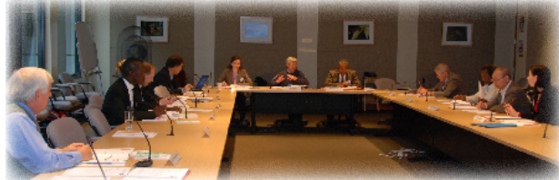
Compliance Committee, Montreal, Canada