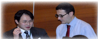
Delegates from Japan and the EC