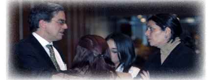
Group of Latin American countries (GRULAC) members consulting