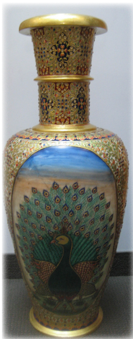
SCBD's newest gift in the museum of nature and culture: Peacock vase of India

For further information: http://www.cbd.int/biosafety/meetings-link.shtml