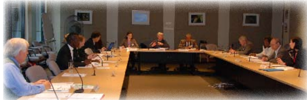
Compliance Committee, Montreal, Canada