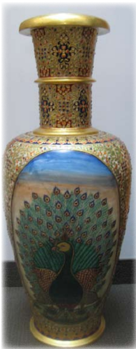
SCBD's newest gift in the museum of nature and culture: Peacock vase of India

For further information: http://www.cbd.int/biosafety/meetings-link.shtml