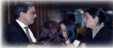
Group of Latin American countries (GRULAC) members consulting