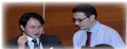
Delegates from Japan and the EC