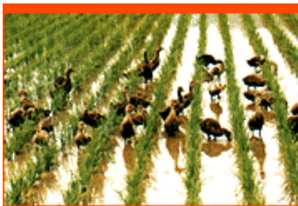
Pic. 4 Organic farming by Drakes

"Eco-village planning in Mun-Dang : Mun-Dang Eco-village in Chungchung province was an ordinary farming village with 65 households before 1994, when the non-polluting agriculture technique "Ori" (means duck in Korean) in a 1-ha arable land was tried and proved to be successful in Korea. Since urban buyers prefer crops raised without the use of chemicals, local growers who adopted "Ori farming" have increased their number by 70%. Owing to such success, Mun-Dang has become a model eco-village. Consequently, the number of young generation farmers is much higher than other rural villages in Mun-Dang. Currently, the village is in the process of transforming itself not only as extraordinary agricultural areas but also as an ecotourist spot from where Southeast Asian farmers can learn valuable lessons.