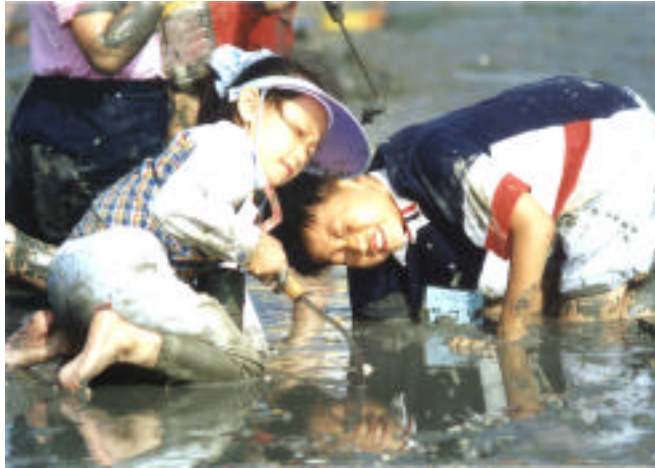
Pic. 7 Environmental Education