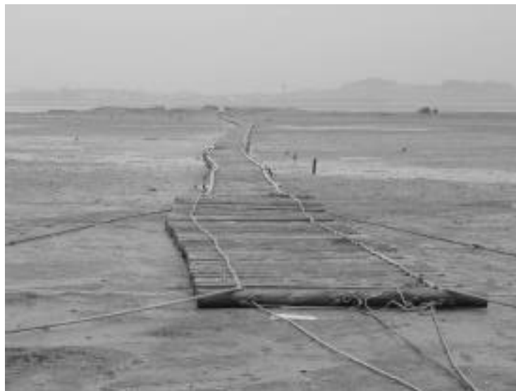
Pic. 6 Bridge for the environmental education