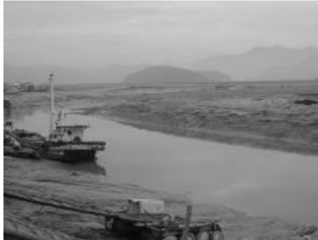
Pic. 2 Tidal flats area