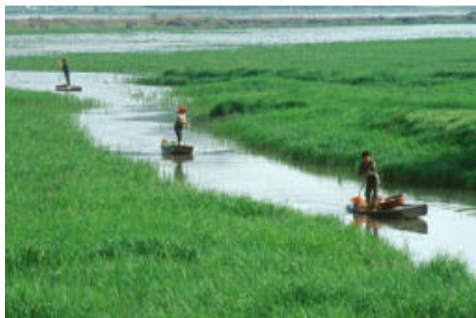
Pic. 3 Woopo Ecosystem Conservation Area