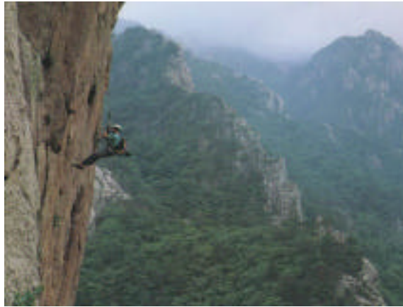
Pic. 1 Mt. Sorak National Park