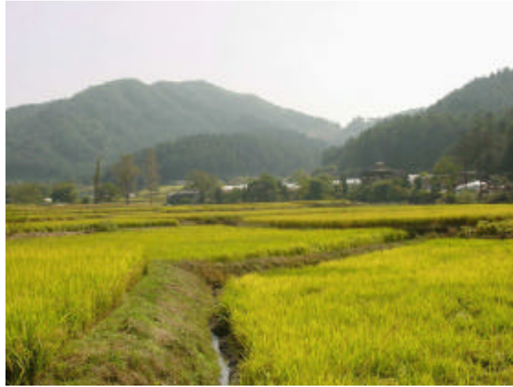
Pic. 5 MyungDal-Ri in YangPyung-Gun