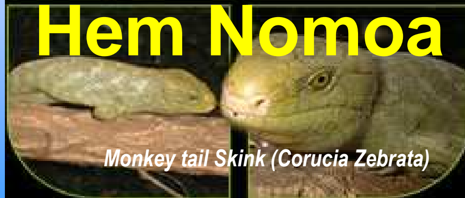
Monkey tail Skink (Corucia Zebrata)