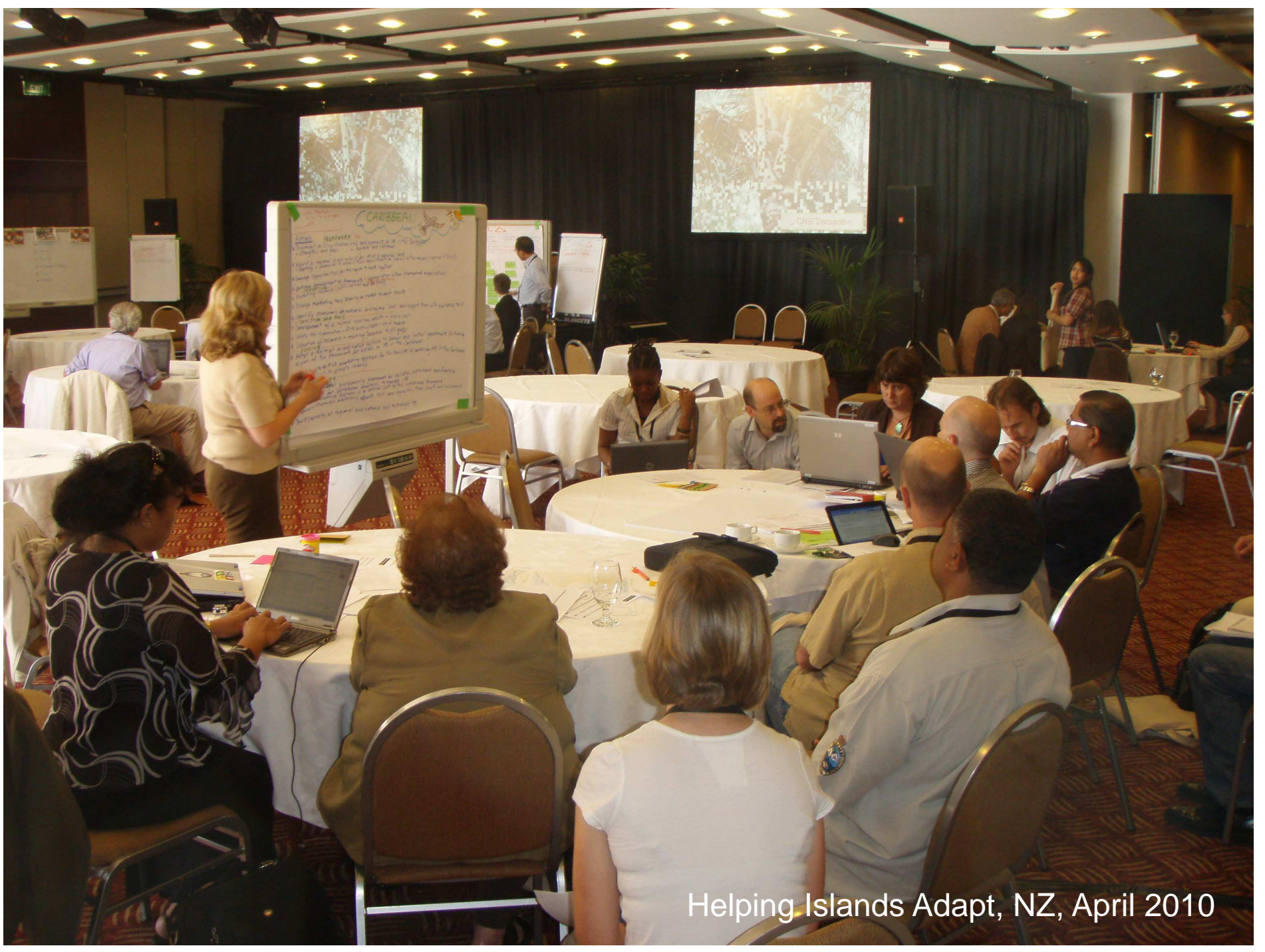
Helping Islands Adapt, NZ, April 2010