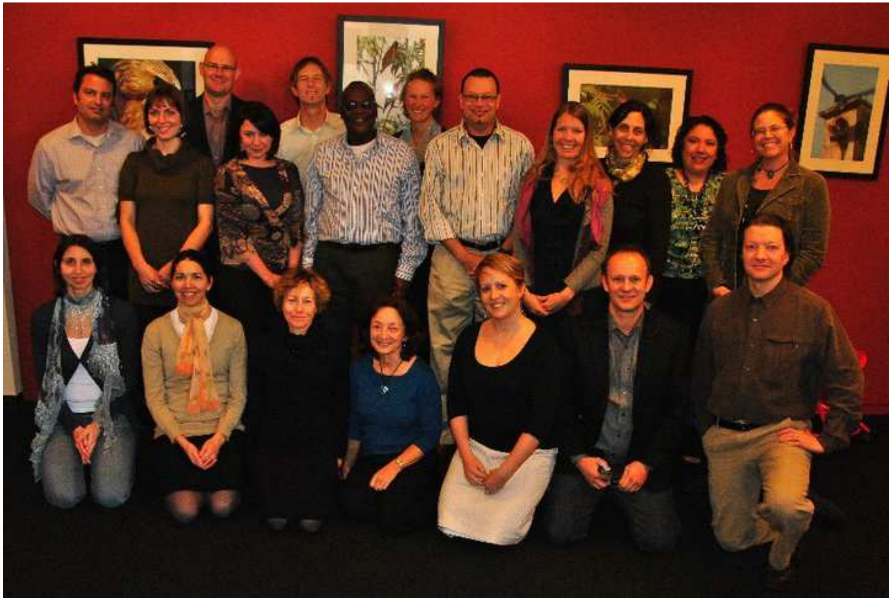
Steering Committee: Seychelles, Palau, Grenada, Italy, TNC, GEF Secretariat, Micronesia Challenge, Caribbean Challenge, CBD Secretariat, Island Conservation, Media Impact, IUCN, UNEP WCMC