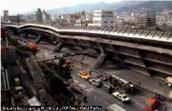
Hanshin Expressway after the Earthquake

Ever since the tragic disaster of the Great Hanshin-Awaji Earthquake in January 1995, various efforts have been made toward “Creative Reconstruction”. Its aim is to achieve more than just returning the region back to the pre-earthquake state, but to recreate the society for further development into the future.