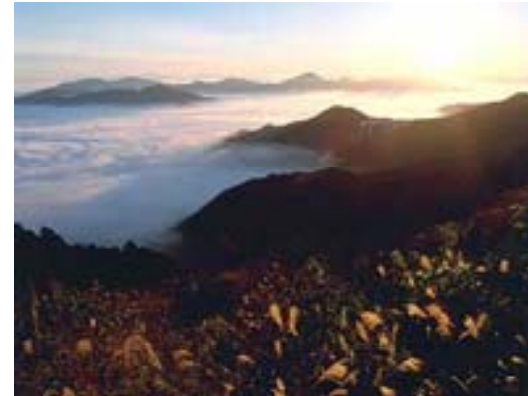
Serene Sea of Clouds in Northern Area