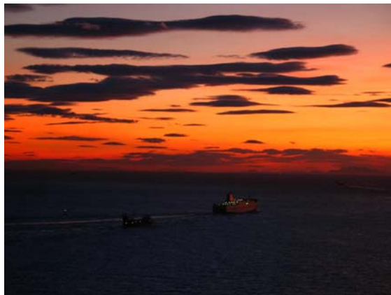
Seto Inland Sea at Sunset

The population of Hyogo is approximately 5.6 million and accounts for 4.4% of the total population of Japan. The industries such as steel, shipbuilding and machinery are concentrated on the Seto Inland Sea coast. While the agriculture, forestry and fisheries industries are widely expanded in the rest of the area. As of 2006, its total real GDP was 21 trillion yen, which accounts for 3.8% of the total GDP of Japan.