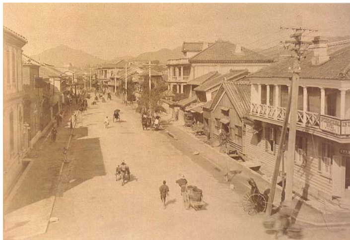
Foreign Settlement in the 19 th Century