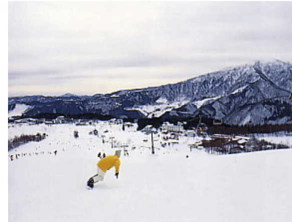
Hachi-Kogen Ski Resort

Hyogo contains a variety of communities from large cities to rural villages, and also isolated islands. Its diversity of natural features, as well as various leisure activities including skiing, swimming in the ocean and bathing in various natural hot springs, attract many tourists all year round. For these reasons, Hyogo has become to be known as a “Japan in miniature”.