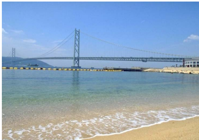
Maiko Beach and Akashi-Kaikyo Bridge