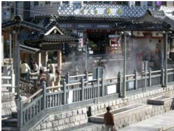
Yumura Hot Spring

Hyogo consists of 5 highly distinctive districts; Settsu (Kobe and Hanshin), Harima, Tajima, Tamba, and Awaji, each of which has its own unique history, climate and industry.