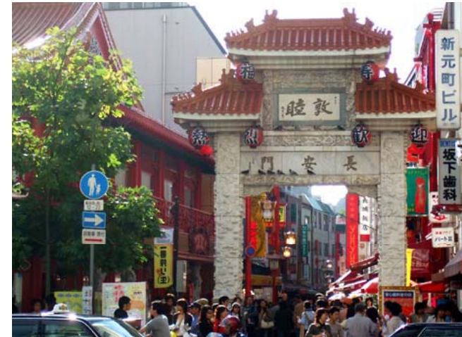
China Town in Kobe

Kobe currently covers an area of 552sq.km (36 km from east to west and 30 km north to south). And despite having to recover from 2 devastating periods in its history (WWII and the Great Hanshin-Awaji Earthquake in 1995), its population has surpassed 1.5 million.