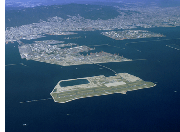
Port of Kobe

Kobe is the busiest container port in the Kansai region, surpassing even Osaka, and the fourth busiest in Japan. As of 2006, its total real GDP was 5.9 trillion yen, which accounts for 28% of the total GDP of Hyogo Prefecture and approximately 1.1% of Japan.