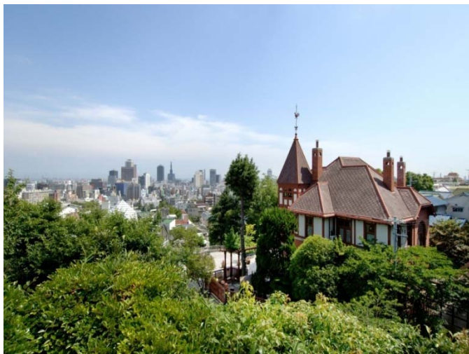
Colonial House in Rokko Mt.

Geographically, Kobe can be roughly divided into 2 sections by the Rokko Mountain Range. The southern area which faces the Osaka Bay, forms the urbanized area, while the western and northern areas have become the construction sites for large-scale new towns that also maintain harmony with their natural surroundings.