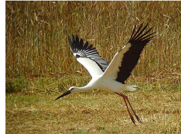
Oriental White Stork