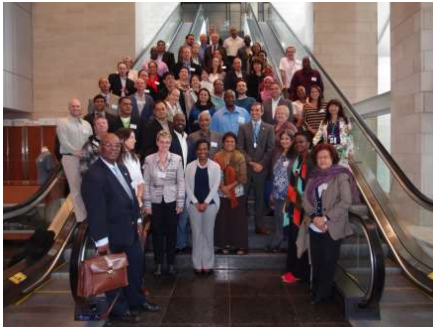
The Workshop Participants