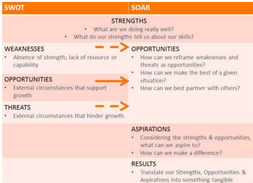
Figure 1. Contrast between SWOT and SOAR.

In the case of invasive species prevention and management this perspective helps us to focus on getting more of what we want, such as species saved, ecosystems restored, cultural values protected, food security, and water security. The results summarized highlight good practices as examples to follow but it not meant to imply that all of these practices are operating in all SIDS not that all these practices are functioning optimally in every case.