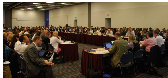
Inter-regional negotiating group at the Palais des congrès de Montréal.