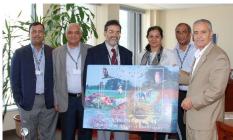
Delegation from India