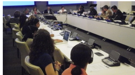
High level panel on gender and biodiversity