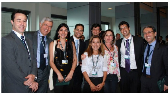
Delegates at the reception hosted by the CBD Secretariat.

report was held from 30 June to 2 July, 2010 in Budapest, Hungary. A few countries from Europe and West Asia attended the workshop and all of them found it useful for their work on the fourth national report.