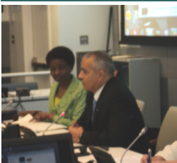
Deputy Secretary General Rose Migiro with Ahmed Djoghlaif, CBD Executive Secretary

To commemorate and contribute to the International Year of Biodiversity, as outlined in the United Nations General Assembly Resolution 63/219, and in support to Resolution 64/289 on the creation of the UN Entity for Gender Equality and the Empowerment of Women - UN Women, the Secretariat in partnership with the Secretariat of the Economic and Social Council of the United Nations held a high-level lunch time panel discussion on "harnessing the gender dimensions of biodiversity, sustainable land management and climate change to achieve environment protection and sustainable development" on 2 July 2010. The discussions clearly demonstrated the inter-linkages between climate change, biodiversity and sustainable land management, as well as how