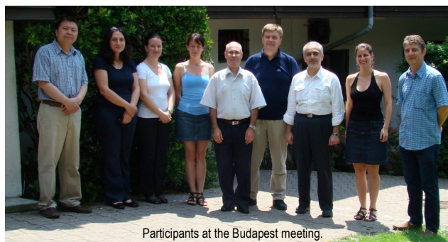
Participants at the Budapest meeting.

report was held from 30 June to 2 July, 2010 in Budapest, Hungary. A few countries from Europe and West Asia attended the workshop and all of them found it useful for their work on the fourth national report.