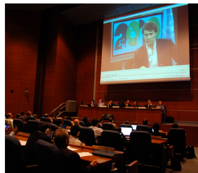
Participants view a video message from Edward Norton, UN Goodwill Ambassador for Biodiversity.