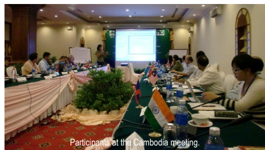
Participants at the Cambodia meeting.

The report of the meeting is accessible at: http://www.cbd.int/doc/meetings/bs/bsrat-as-01/official/bsrat-as-01-mop-05-inf-17-en.pdf