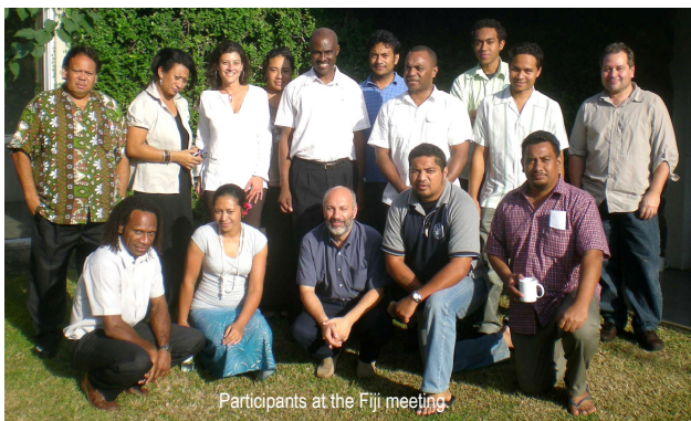
Participants at the Fiji meeting.

Pursuant to paragraph 12 of COP-MOP decision BS-IV/11, and following an offer from the Government of Fiji to host the workshop and the generous financial contributions from the Governments of the Netherlands, Norway and Spain, the Pacific Sub-regional Workshop on Capacity-building and Exchange of Experiences on Risk Assessment and Risk Management of Living Modified Organisms was held in Nadi, Fiji, from 5 to 7 July 2010. The workshop focussed on how conducting risk assessment in the context of the Cartagena Protocol on Biosafety; understanding the general framework in which the risk assessment has to be conducted and how to establish an interdisciplinary teamwork in the context of risk assessment. With the help of a case-study on risk assessment, participants took part in a hands-on group exercise to put into practice some of the concepts learnt and discussed how risk assessors may communicate the outcomes of a risk assessment in a structured report so as to provide relevant information and recommendations to decision makers. Twelve participants nominated by six Parties to the Protocol (Fiji, Kiribati, Niue, Samoa, Solomon Islands and Tonga), two non-Party countries (Cook Islands and Vanuatu) and one organization (University of Canterbury, New Zealand) attended the workshop. The report of the meeting is accessible at: http://www.cbd.int/doc/meetings/bs/bsrwebpac-01/official/bsrwebpac-01-mop-05-inf-16-en.pdf .