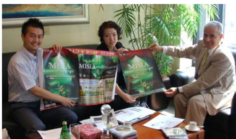
Representatives of MISIA, Honorary Ambassador for COP 10