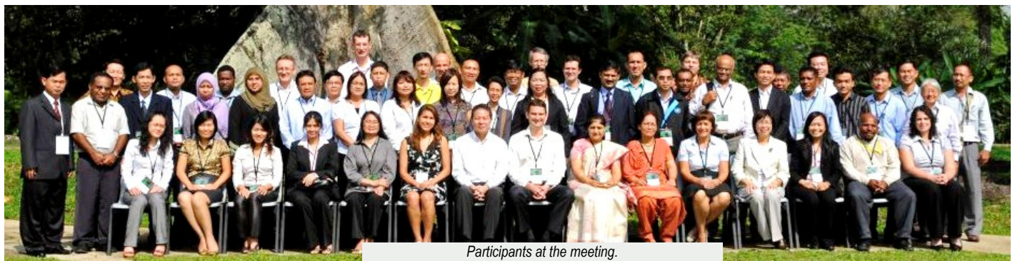
Participants at the meeting.