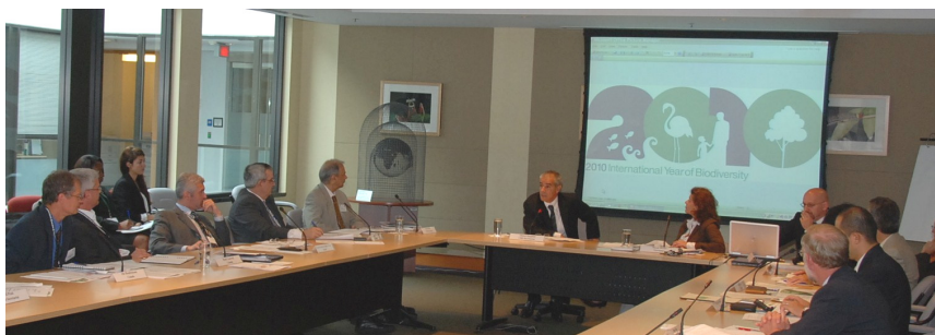
Deliberations during the informal brainstorming session: on business and biodiversity.

On 14-15 September, an informal brainstorming session was held at CBD Secretariat with a view to advancing COP decisions VIII/17 and IX/26 on engagement with the private sector. The meeting was held with the participation of the COP Triple Presidency (Brazil, Germany and Japan) and with the participation of Canada and the Netherlands. Representatives from relevant organizations took part on the second day, including: GEF, UNEP-DTIE, IUCN, WBCSD, Nippon Keidanren Committee on Nature Conservation, the Canadian Business and Biodiversity Initiative, Lasting Initiative for Earth, and Finance Alliance for Sustainable Trade. The meeting decided on a timetable defining the next steps, which included elements of a strategy to advance the business and biodiversity agenda post-2010 and reaffirmed their commitment to a meaningful and effective business and biodiversity initiative to Nagoya in October 2010. The brainstorming session also served as an informal preparatory meeting for the "Third Business and 2010 Biodiversity Challenge Conference", to be convened by the Secretariat in collaboration with UNEP, on 30 November-3 December 2009 in Jakarta.