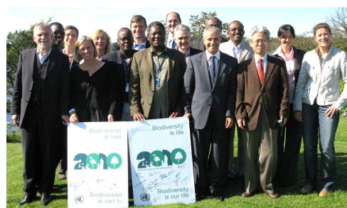
COP 9 Bureau members with the IYB logo.

Immediately after the high level conference, the COP 9 Bureau held its fifth meeting on 9-10 September. The Bureau members discussed: availability of financial resources for the implementation of COP-9 decisions, revision of the CBD Strategic Plan, update on TEEB study, preparations for the GBO-3, IYB and UNGA high level session, the Nagoya biodiversity meetings, and contribution to the UNFCCC