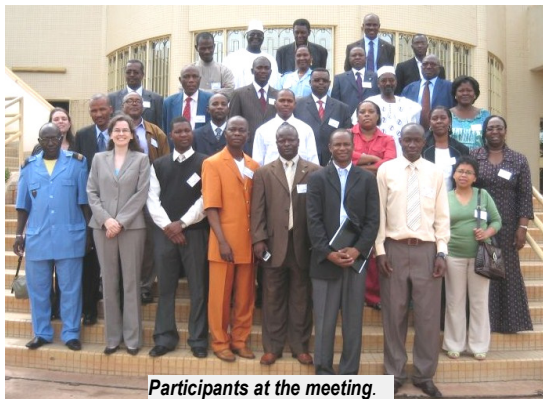
Participants at the meeting.