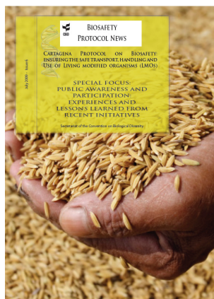
Biosafety Protocol News Issue 6: Public Awareness and Participation: Experiences and Lessons Learned from Recent Initiatives http://www.cbd.int/doc/newsletters/bpn/bpn-06.pdf