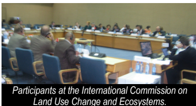
Participants at the International Commission on Land Use Change and Ecosystems.