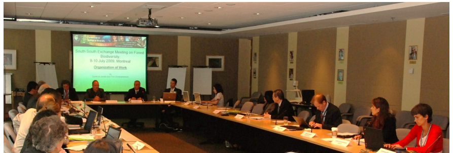
Participants in the informal South-South Exchange meeting.

experts from the regional organizations international partners of the Convention on Biological Diversity, such as the Secretariat of the United Nations Forum on Forests, representatives of Parties to the Convention, and resource persons. The objective of the meeting was to enhance capacity within and foster exchange between regional organizations for a more effective and efficient implementation of tools and approaches linked to instruments of international forest-related agreements, this supporting sustainable forest management and poverty alleviation efforts at national and local levels. The results and findings of the meeting will be presented and further discussed between Regional organizations during the World Forestry Congress in Buenos Aires, Argentina on 18-23 October 2009. To view the final report of the meeting , please go to: http://www.cbd.int/doc/meetings/ssc/bmssc-02/official/bmssc-02-02-en.doc .