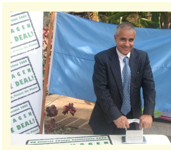
CBD Executive Secretary supports the UN-led Seal the Deal campaign 18 July 2009 Nairobi, Kenya