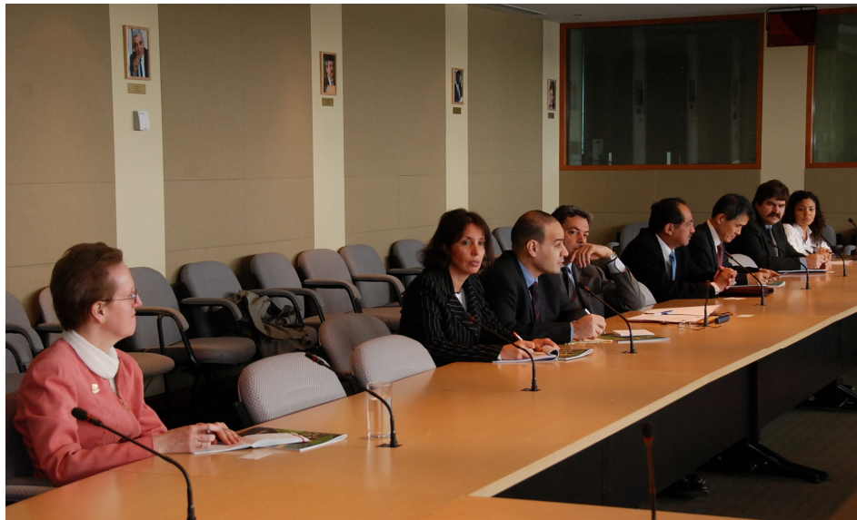
Briefing of Montreal diplomatic corps on COP-MOP 4 and COP 9 meetings, which took place on 5 May 2008 at the CBD Secretariat.