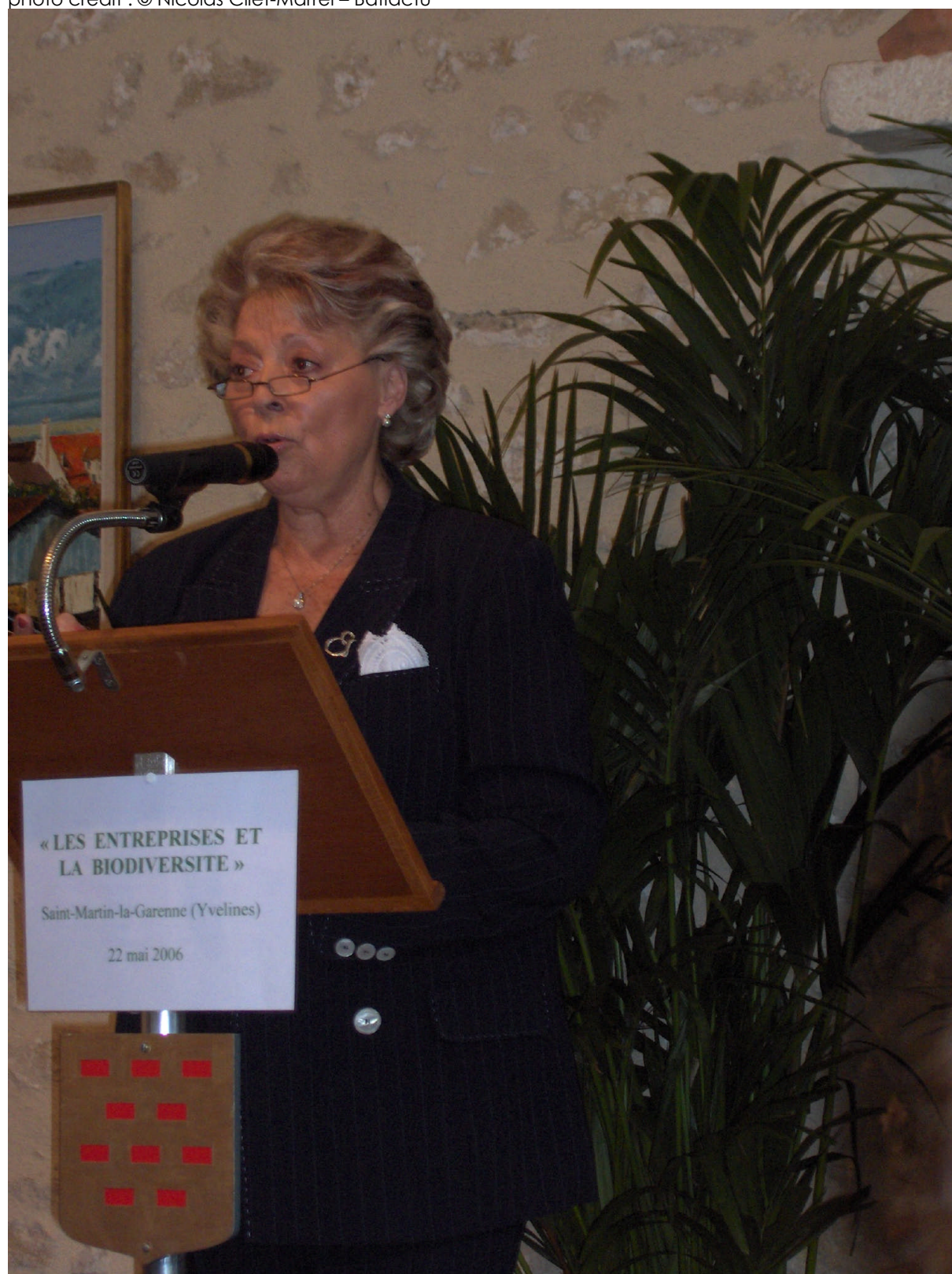
The Minister of Ecology and sustainable development, Mrs Nelly Olin, delivering a speech on biodiversity conservation in the industrial field at the town hall of Saint-Martin-La Garenne (78).