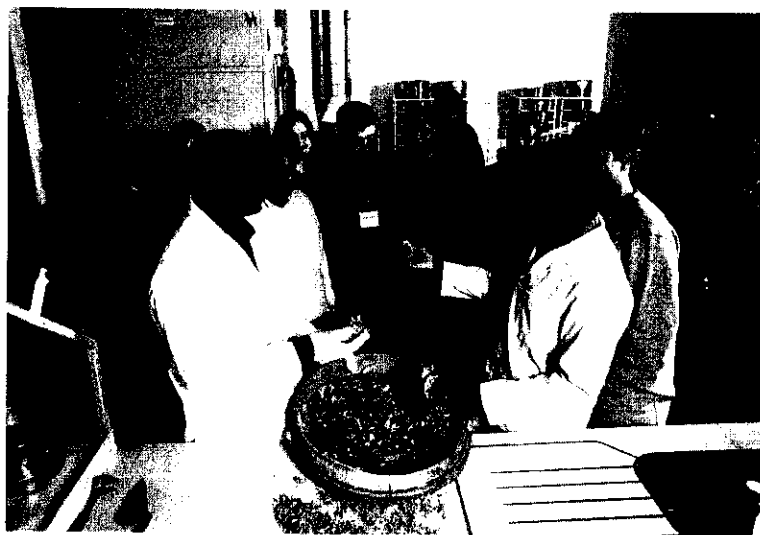
The facilities of the Wellcome Trust Millennium Building are used for formal and informal training. Here Kenyan partners on a technical training attachment are demonstrating seed processing to MSc students from the University of Birmingham.

Some earlier projects to transfer seed banking technology have taken the 'turn key' approach. This involves the construction, demonstrated operation, and commissioning or handover of a facility by technical experts from the supplying country to the recipient country iv . This is not the approach taken by the MSBP. Rather it aims to use technological and scientific co-operation to help establish and strengthen capacity for ex situ conservation. Combining partners knowledge and understanding of their native plants with the seed banking technologies developed by RBG Kew is the essence of the MSBP. Technology is transferred from RBG Kew to its partners, between the partners (both inter and intra nationally) and from partners to RBG Kew. In addition to the formal project partners, the MSBP has developed a wide range of additional international collaborators.