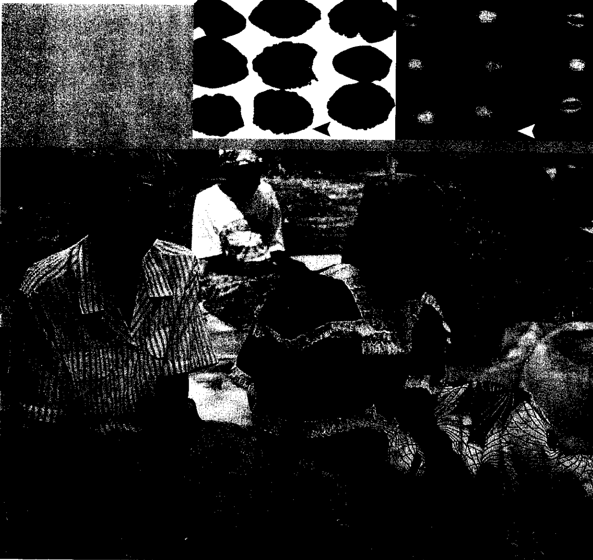
Hand cleaning of seeds in Burkina Faso.