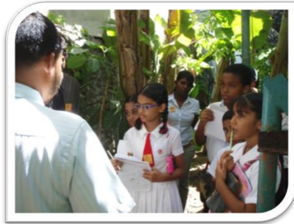
School Children inside the Nursery

A special information session on biodiversity and agriculture was held at Male' Nursery for school children on 22 May 2008. The fun filled yet educational session was a success as the participants showed keen interest in all activities and games related to agriculture and biodiversity of the Maldives. Resource personnel from Environment Research Centre and Ministry of Fisheries, Agriculture and Marine Resources covered topics on organic fertilizers, sustainable agriculture, and importance of biodiversity for agriculture and conservation of biodiversity.