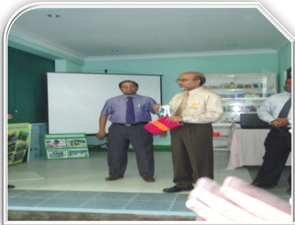
Deputy Minister Releasing the Book

A book on trees and shrubs of the Maldives developed under the Forestry Project was released by the Deputy Minister of Fisheries, Agriculture and Marine Resources. This book contains information on the identity, ecology and use of over 100 species of trees and shrubs found in the Maldives.