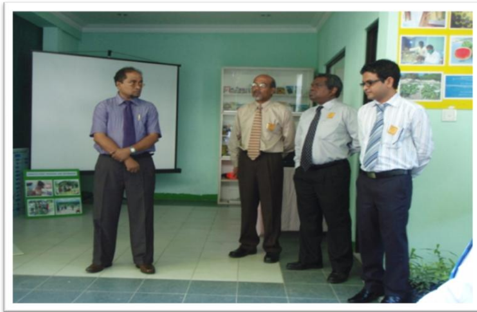
Deputy Minister addressing the participants of the meeting

A special meeting to mark the International Day for Biological Diversity was organized by the Environment Research Centre on the morning of 22 May 2008 in collaboration with Ministry of Fisheries, Agriculture and Marine Resources. The meeting was inaugurated by the Deputy Minister of Environment, Energy and Water, Mr. Abdullahi Majeed. In his speech, the Deputy Minister spoke about the critical importance of biodiversity conservation for human well-being, food security and protection of the rich biodiversity of the country. The meeting was also attended by Deputy Minister of Fisheries, Agriculture and Marine Resources, Mr. Mohamed Zuhair as well.