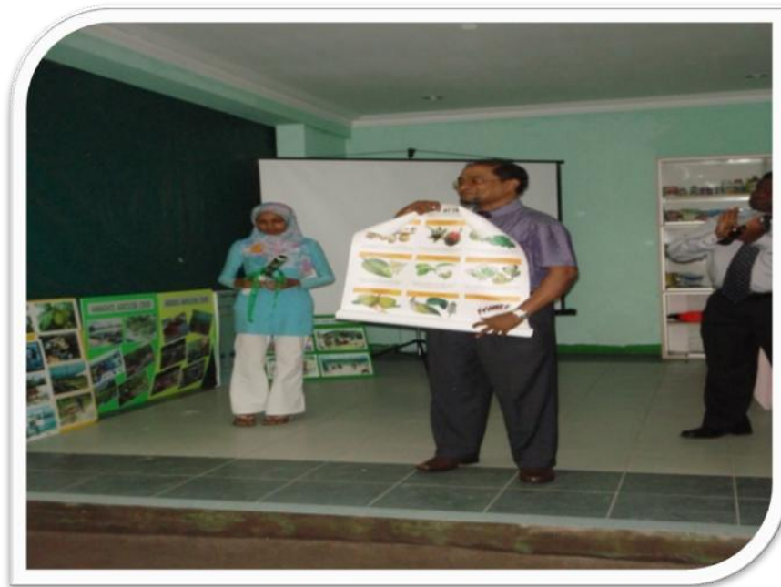
Deputy Minister Releasing the Poster

A poster with images, scientific, common and local names of all the thirteen (13) species of mangroves found in the Maldives produced under the “Huraa Mangrove Park” project was released by the Deputy Minister of Environment, Mr. Abdullahi Majeed. A poster of different birds found in the wetlands and mangroves of the Maldives was also released at the meeting.