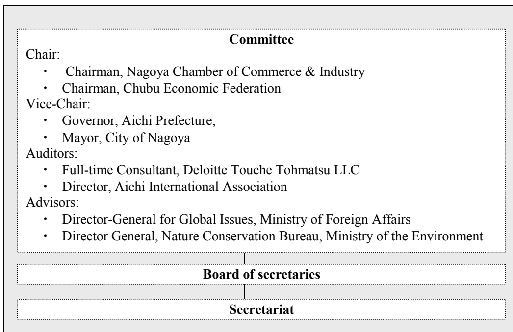
Table2.2 Organizational structure of the Aichi-Nagoya COP10 CBD Promotion committee