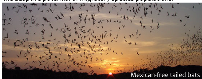
Mexican-free tailed bats

With carbon dioxide emissions already reaching 387ppm and causing significant and irreversible ecosystem change, it is evident that emphasis needs to be placed not only upon mitigation of greenhouse gas emissions, but also on maximising the adaptive potential of migratory species populations.