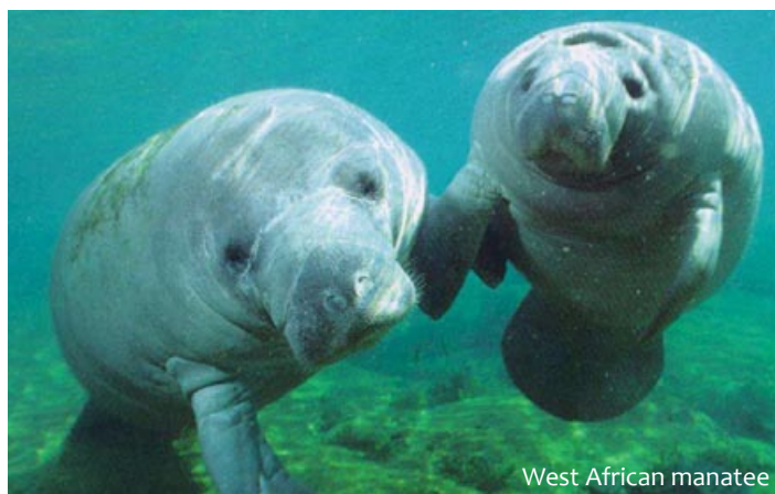
West African manatee

More erratic weather regimes, which increase the incidence of phenomena such as hurricanes, droughts and floods, are predicted to become more frequent 25 . This is likely to increase the vulnerability of many species in the future. Half of the CMS Appendix I species studied to date have been identified as vulnerable to increased incidences of extreme weather, mainly through direct impacts on mortality rates.