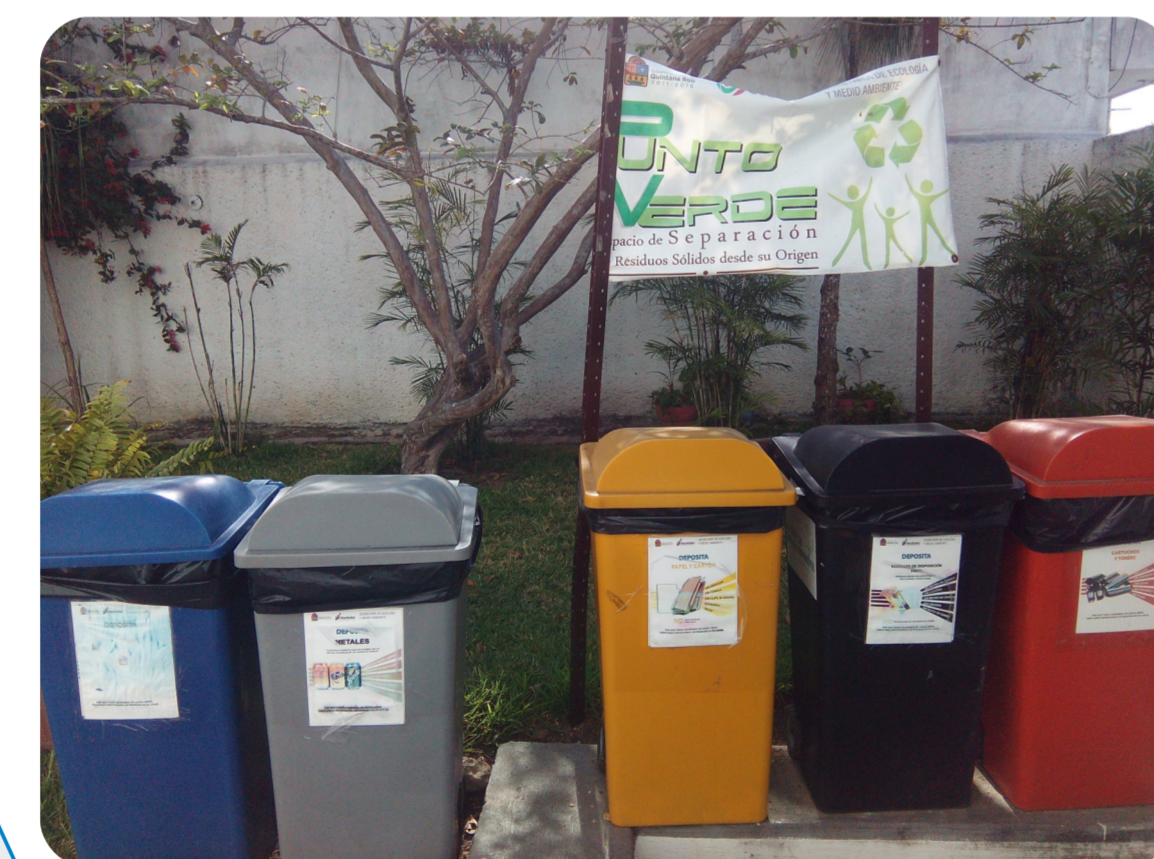
Solid waste separation in government offices.