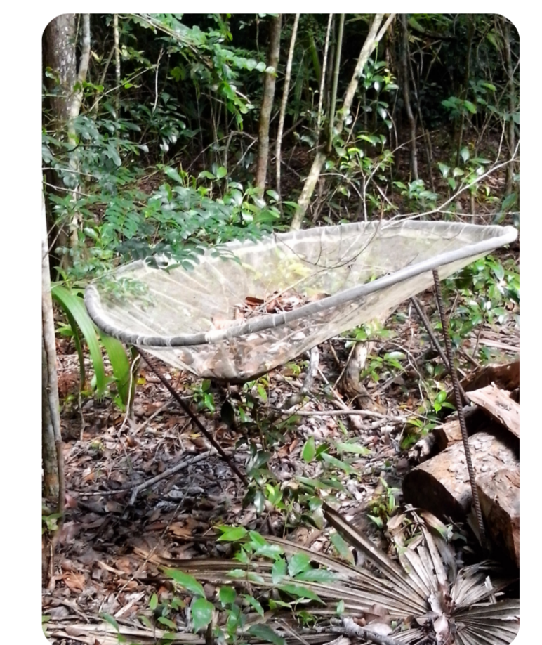
Workshop of carbon capture monitoring in the municipality of Felipe Carrillo Puerto.

Its goal is to develop and implement sustainable development policies, to achieve economic and social development without compromising natural capital and human wellbeing of future generations.