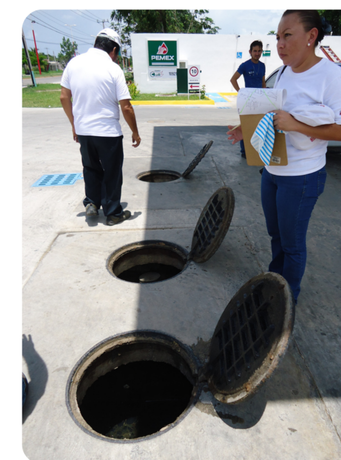
Fuel station inspection.

If stationary sources do not meet the parameters of environmental standards, the necessary corrective measures should be carried out, in order to correct the parameters outside of the standards.