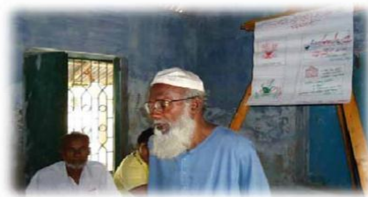
Figure: Experienced Goalpata collector is conducting training to young collectors at Naksha village