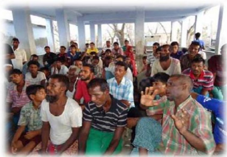
Figure: People of different ages are grouped together and sharing their knowledge on natural resources management