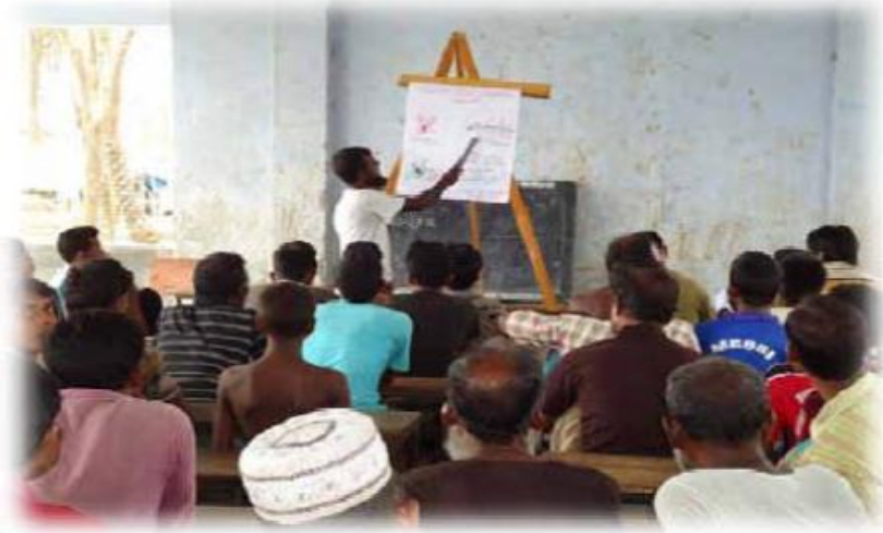
Figure: Experienced Resource Collector (community member) is Conducting Training at 4 No. Koyra