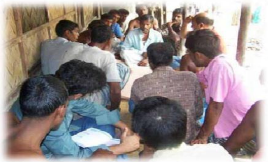
Figure: Munda cultural team is singing a song in their own language. The song is about conservation of biological resources for sustaining agriculture production