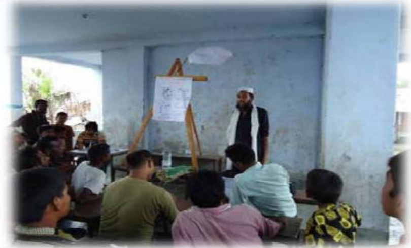
Figure: Religious leader is informing the local community regarding customary rules of resource collection