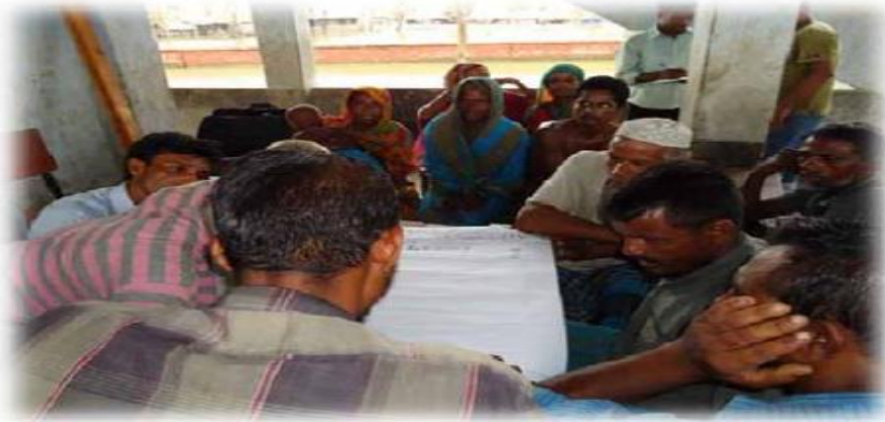
Figure: Experienced resource collectors are preparing vulnerability map at 4 No. Koyra