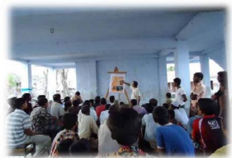
Figure: Community people is being informed about traditional fishing system of Nicaragua