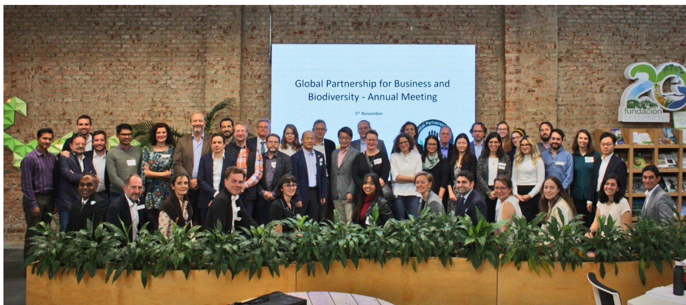
Participants of the 9 th Annual Meeting of the GPBB, in 2019